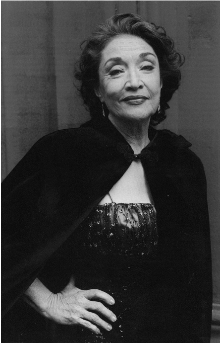
Premio a Toda Una Vida de Dedicacion a las Artes 2007