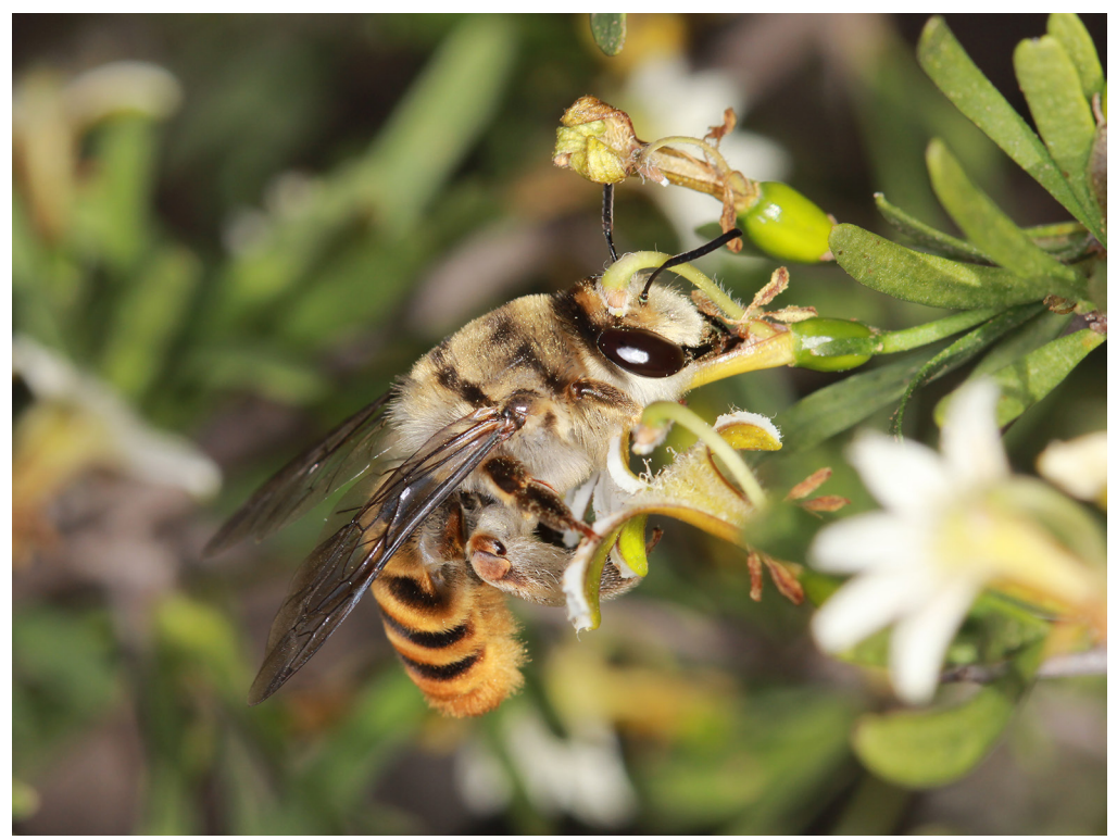
Figure 1. Female of Ctenocolletes ( Ctenocolletes ) nicholsoni (Cockerell) at a flower of Scaevola Linnaeus (Goodeniaceae) in Western Australia.