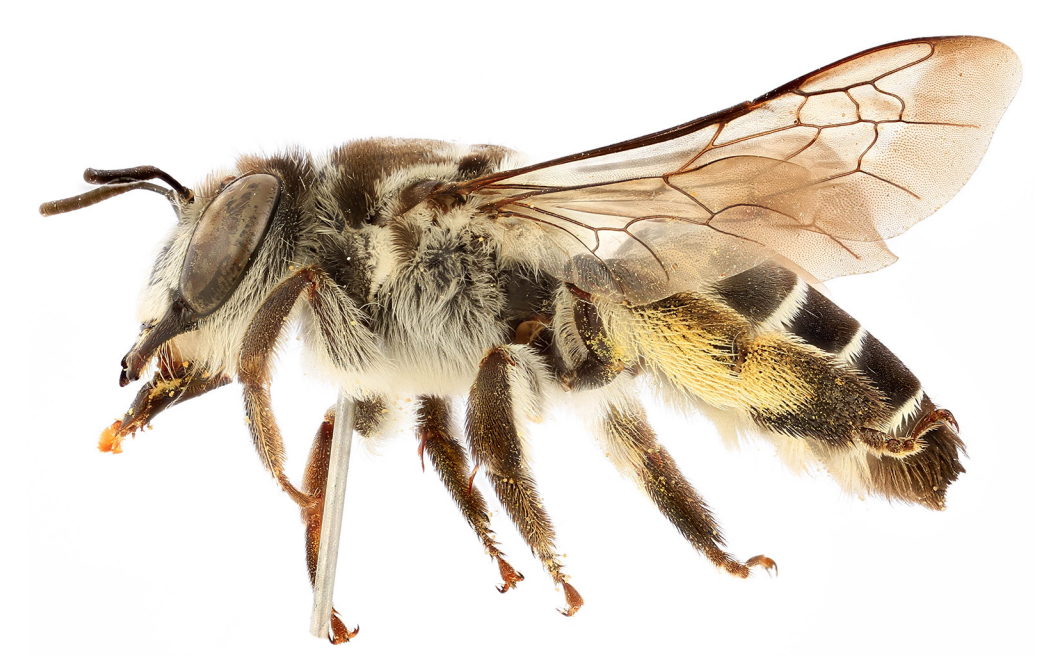
Figure 2. Lateral habitus of female of Ctenocolletes (Ctenocolletes) nigricans Houston.

Houstonapis Engel, new subgenus ZooBank: urn:lsid:zoobank.org:act:B3E1BD8D-46ED-40F3-9FF6-1A79D6EC03FC