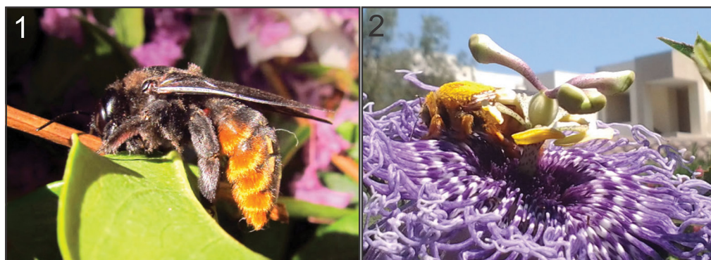
Figures 1–2. Xylocopa ( Neoxylocopa ) augusti Lepeletier de Saint Fargeau. 1. Female. 2. Male on Passiflora sp. (Passifloraceae).

Chile, namely the Instituto de Entomología of the Universidad Metropolitana de Ciencias de la Educación, Pontificia Universidad Católica de Valparaíso, and the collection Flaminio Ruiz in San Pedro Nolasco.