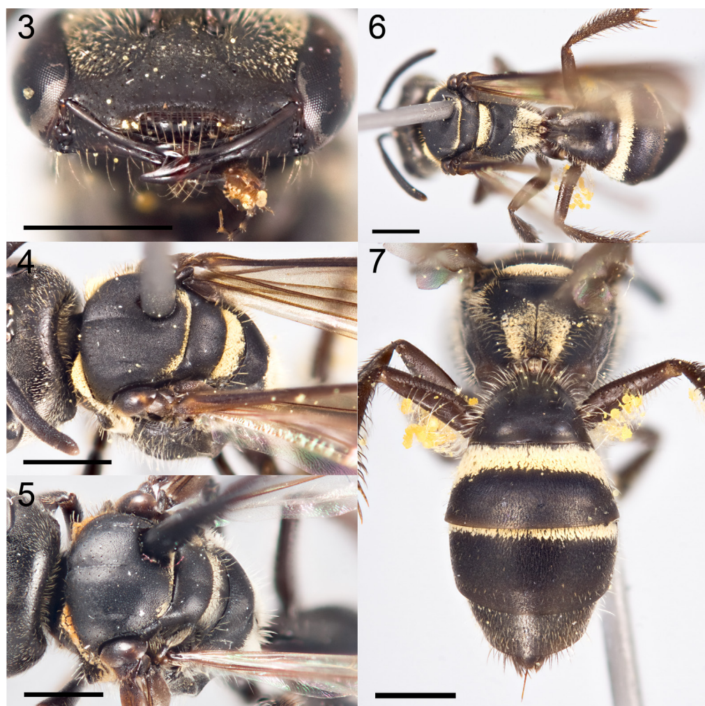
Figures 3–7. Females of Lasioglossum ( Eickwortia ) hienae , new species (3, 4, 6, 7) and L. (E.) nyctere (Vachal) from Veracruz Prov., Mexico (5). 3. Mandibles. 4, 5. Dorsolateral views of mesosoma. 6. Dorsal habitus. 7. Dorsal view of metasoma and posterior view of propodeum. Scale bars = 1 mm.

metanotum, mesopleuron and lateral portions of metasomal terga (1.5–2.5 OD). Paracocular area with short, subappressed tomentose setae (Fig. 2). Gena with tomentum adjacent to compound eye (Fig. 1). Pronotal lobe and posterior margin with dense tomentum (Figs. 1, 4). Mesoscutum with posterior margin tomentose (Fig. 4). Metanotum almost entirely obscured by tomentum (Fig. 4). Metafemur with well developed scopa (Fig. 7). Propodeal posterior surface obscured by tomentum (Fig. 7), dorsal portion of lateral surface with sparse tomentum. T1 with sparse, erect plumose setae; T2–T4 with dense basal tomentose bands, thickest and most evident on T2 (Fig. 7). Metasomal sterna with plumose scopa (3–4.5 OD).