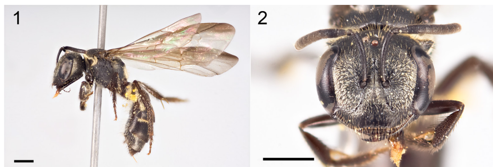
Figures 1–2. Holotype female of Lasioglossum (Eickwortia) hienae , new species. 1. Lateral habitus. 2. Face. Scale bars = 1 mm.

DESCRIPTION: ♀, Length 6.5 mm. Head length 1.95 mm. Head width 2.31 mm. Intertegular distance 1.43 mm.