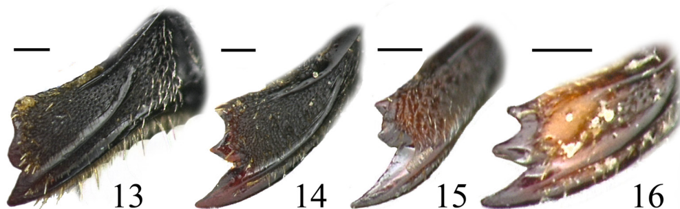
Figures 13–16. Female mandibles. 13. Protosmia montana Müller. 14. P. schwarzi , new species. 15. P. trifida , new species. 16. P. hamulifera , new species. Scale bars represent 0.1 mm.

dially-directed fringe. S4 with sparse, long setae covering most of disk, margin moderately convex, without lateral notch, with distinctly separated pair of medially-directed fringes. Genitalia and associated sterna as in figures 7–9.