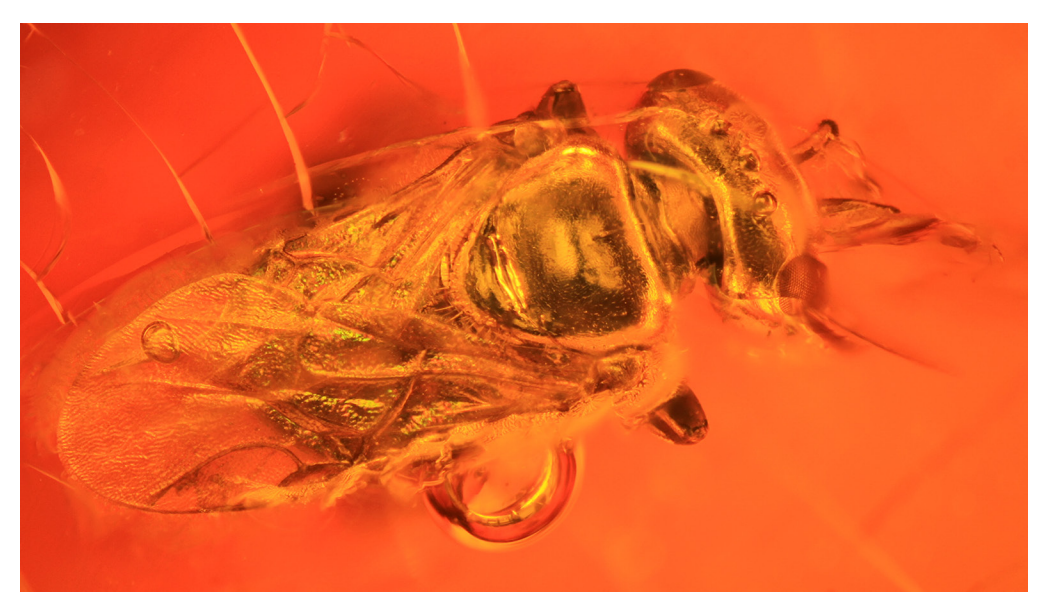
Figure 1. Dorsal photomicrograph of holotype worker of Exebotrigona velteni , new genus and species, in Eocene amber from the Fushan Coalfield. Metrics of individual provided in description.

Herein we describe the first fossil stingless bee, and indeed the first fossil bee in general, from the Eocene amber deposits of Liaoning, China (Figs. 1–3). This represents a significant biogeographic and temporal record for fossil Apoidea and we strongly hope that additional specimens and species will be recovered in time.