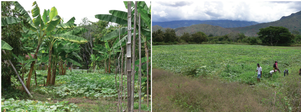
Figure 2. Squash fields ( Cucurbita moschata Duchesne ex Poiret) surveyed in the municipality of El Patía, Department del Cauca, southwestern Colombia. Left, study site at El Juncal associated with plantain. Right, study site at Angulo, the largest crop surrounded by grazing pastures and secondary vegetation.

are found within the valley of the Patía River, between the western and central Andean cordilleras. Most of the squash cultivated in Colombia is at a small scale (e.g., Tobar et al. , 2010), and as in other areas of the country, the crops surveyed were part of small farms and were planted primarily for local consumption. The variety cultivated at the study area is the Unapal–Bolo Verde (Vallejo et al. , 1999). The area of each crop varied among sites, from 100 m 2 in Chondural to 4500 m 2 in Angulo. Crops were separated from each other by at least 4 km and were located close to the farmers' houses, near paved roads. The surrounding vegetation also varied among sites; crops were either surrounded by grazing pastures or by sparse patches of low secondary vegetation ( i.e. , natural vegetation established after disturbance), except in El Juncal where squash was planted among plantain (Fig. 2). Bees were collected inside all flowers that were found open from 8:00 to 12:00 hours, except for the Western Honey Bee [ Apis (Apis) mellifera Linnaeus], which could be easily identified by sight. Voucher specimens are deposited in the Departamento de Biología, Universidad del Cauca, Popayán, Colombia and the Division of Entomology, University of Kansas Natural History Museum, Lawrence, Kansas, USA.