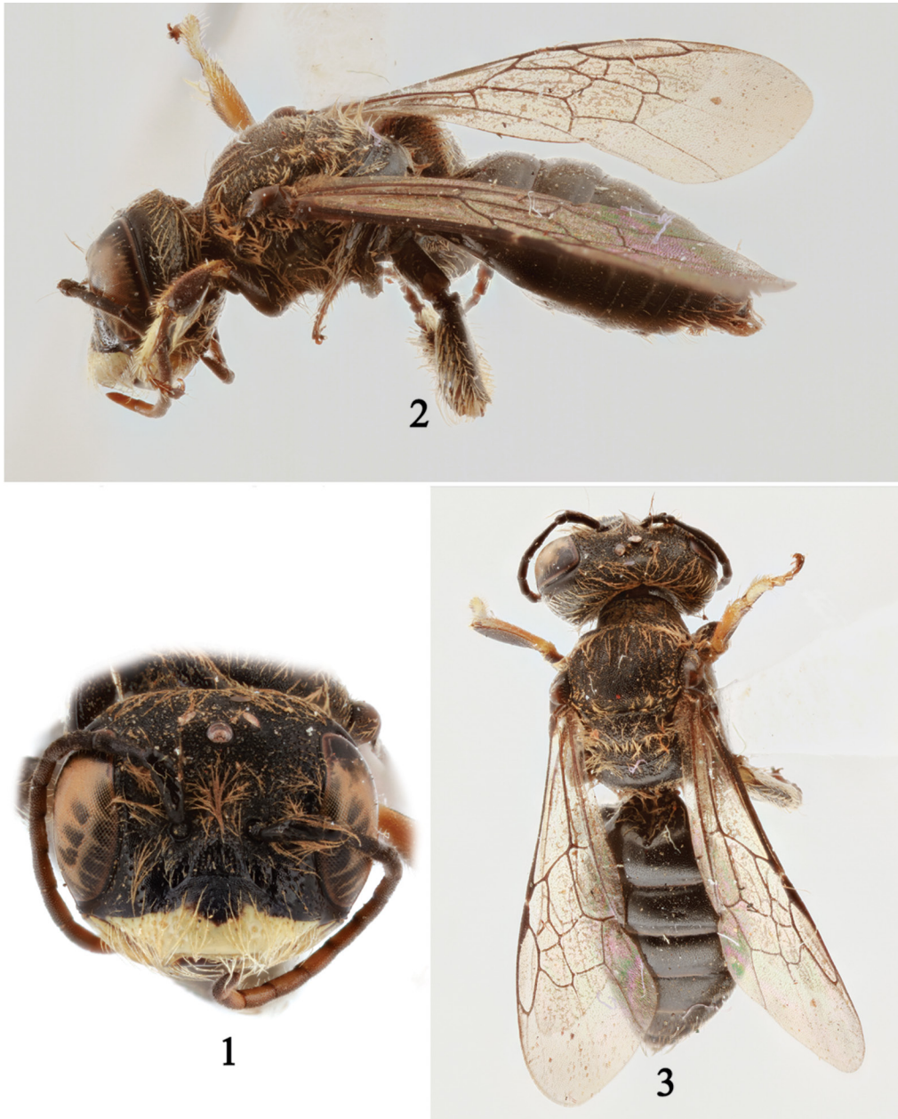
Figures 1–3. Male holotype of Liphanthus ( Melaliphanthus ) cuscoensis , new species. 1. Facial view. 2. Lateral habitus. 3. Dorsal habitus.

longer than broad, slightly shorter than third, remaining flagellomeres progressively increasing in length, apical flagellomere longest; malar area linear; mandible strongly curved, simple, with outer ridge strong. Mesosoma narrower than head width; mesoscutum 1.4 times wider than long, 2.3 times longer than mesoscutellum, about 5 times longer than metanotum; protibial spur with apical portion of rachis about as long as malus, with about 10 elongate branches (not including apical portion of rachis); probasitarsus curved, 3.5 times longer than broad; mesotibial spur ciliate, straight or nearly