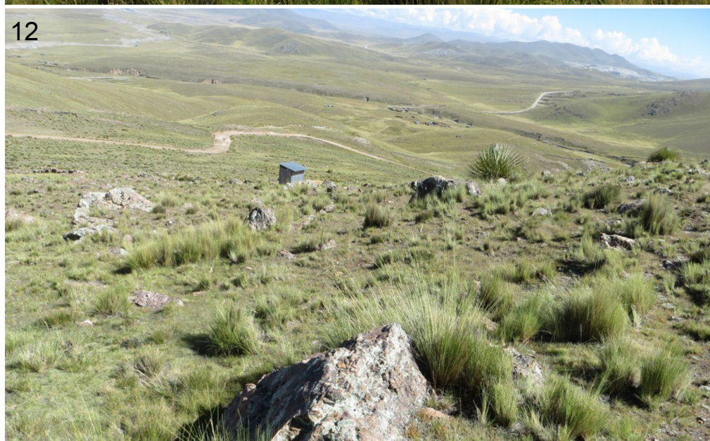
Figures 11–12. Photographs of the Puna grassland habitat in which Liphanthus ( Melaliphanthus ) cuscoensis , new species, was captured. 11. View looking across the grassland. 12. View looking down a long slope near Chaisamayo brook.

erect on seventh tergum and preapical sublateral swellings of second to fifth sterna. Sixth sternum with long, stiff, spatulate setae forming lateral and central patches on disc (Figs. 4, 5). Gonostylus laterally with long, minutely-branched setae (Figs. 8, 9).