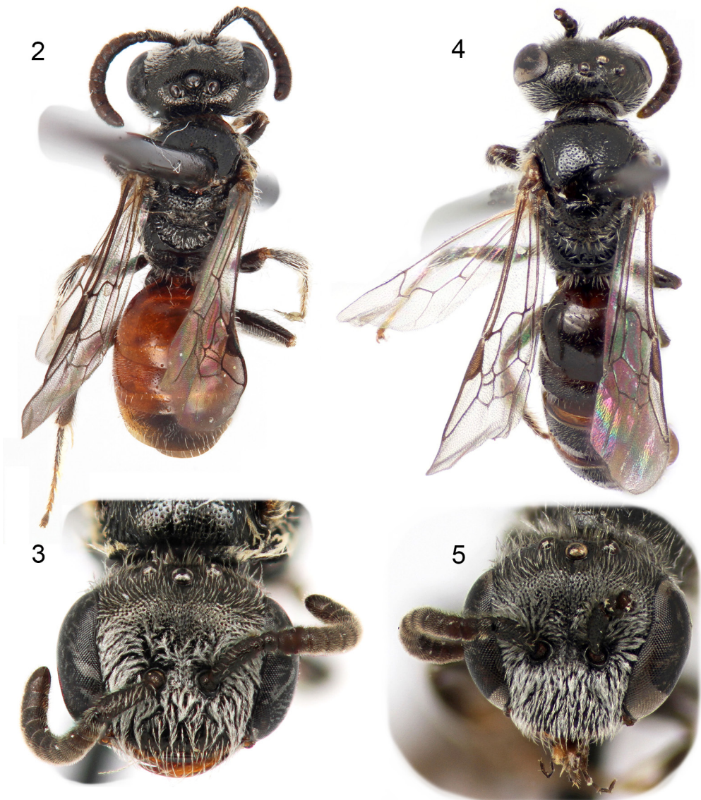
Figures 2–5. Sphecodes (Austrosphcodes) tainoi Engel from Puerto Rico. 2. Dorsal habitus of female. 3. Facial view of female. 4. Dorsal habitus of male. 5. Facial view of male.

ries had been stored under variable conditions since 1967), terga I–III sometimes more completely orange, some individuals with reddish orange coloration extending across more apical terga, sternum IV typically lighter apically; setae more densely branched lower on face.