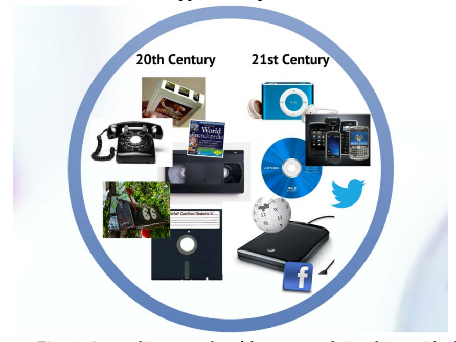
Fig. 1. A graphic example of how our relationships with data and modes of communication have changed rapidly over the past few decades with advances in computing and information technology

mote the use of ORCiD (https://orcid.org/) and common metadata standards. We also encourage the use of shared research infrastructure such as NSF XSEDE, the Open Science Grid (OSG), Galaxy (https://galaxyproject.org/), and CyVerse [see Figure 3]. These activities are of particular interest to faculty associated with federally supported research centers who are obligated to comply with federal data sharing standards and expectations. Sharing and hosting large amounts of research data can be both time consuming and costly, while universities that receive public research funding have an obligation to conduct 'open science' and share their research products. How to finance the maintenance and effective sharing of data in the era of Big Data and the Internet of Things (IoT) remains an open challenge [4], and one we must surmount if we are to remain the stewards of research for public benefit.