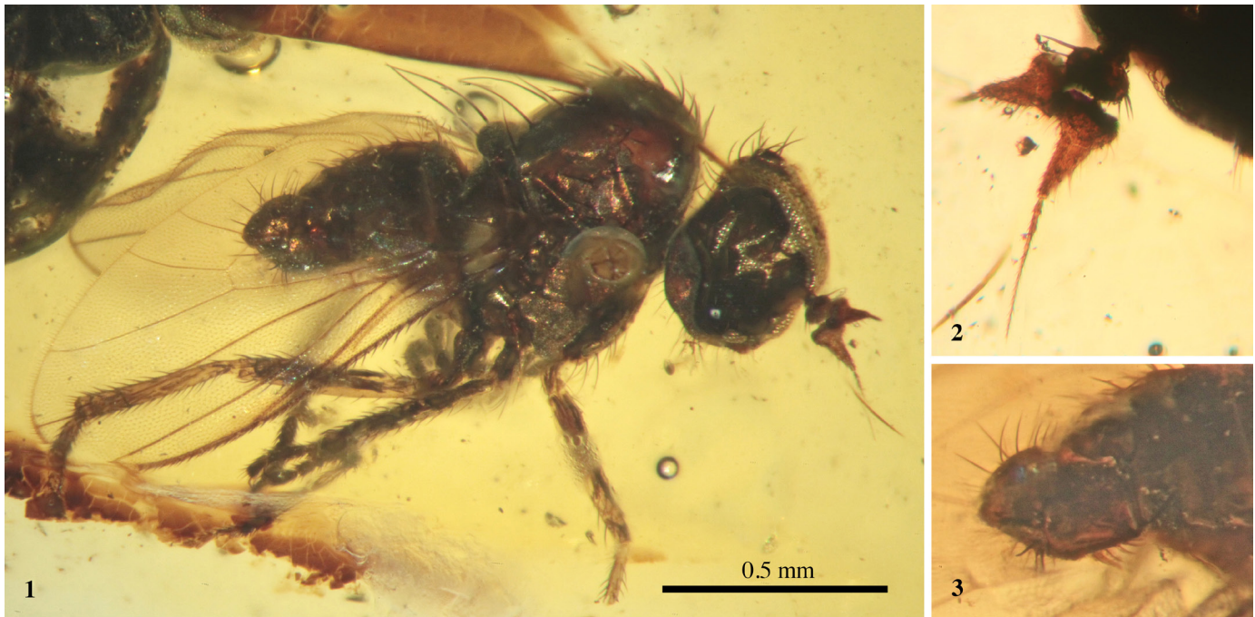
Figure G1. Microphorites magaliae n. sp., holotype male IGR.GAR-106a, in Late Cretaceous amber of Vendée, NW France. 1, habitus in right lateral view; 2, detail of antennae; 3, detail of the genitalia.

terminalia rotated forward beneath the preceding segments of the abdomen (Wiegmann, Mitter, & Thompson, 1993). Microphorinae and Parathalassiinae are distinguished from other dolichopodids by the presence of an additional basal crossvein (bm-cu) and crossvein dm-cu connected to the base of M_2 . Recent molecular analyses even suggest that Parathalassiinae are part of Dolichopodidae s.str. , with Microphorinae as sister group to the latter (Germann & others, 2011).