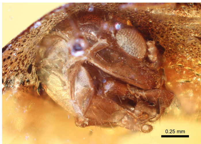
Figure E1. Photomicrograph of head of holotype of Termitotron vendeense n. gen. and sp.

Type species. — Termitotron vendeense , new species.