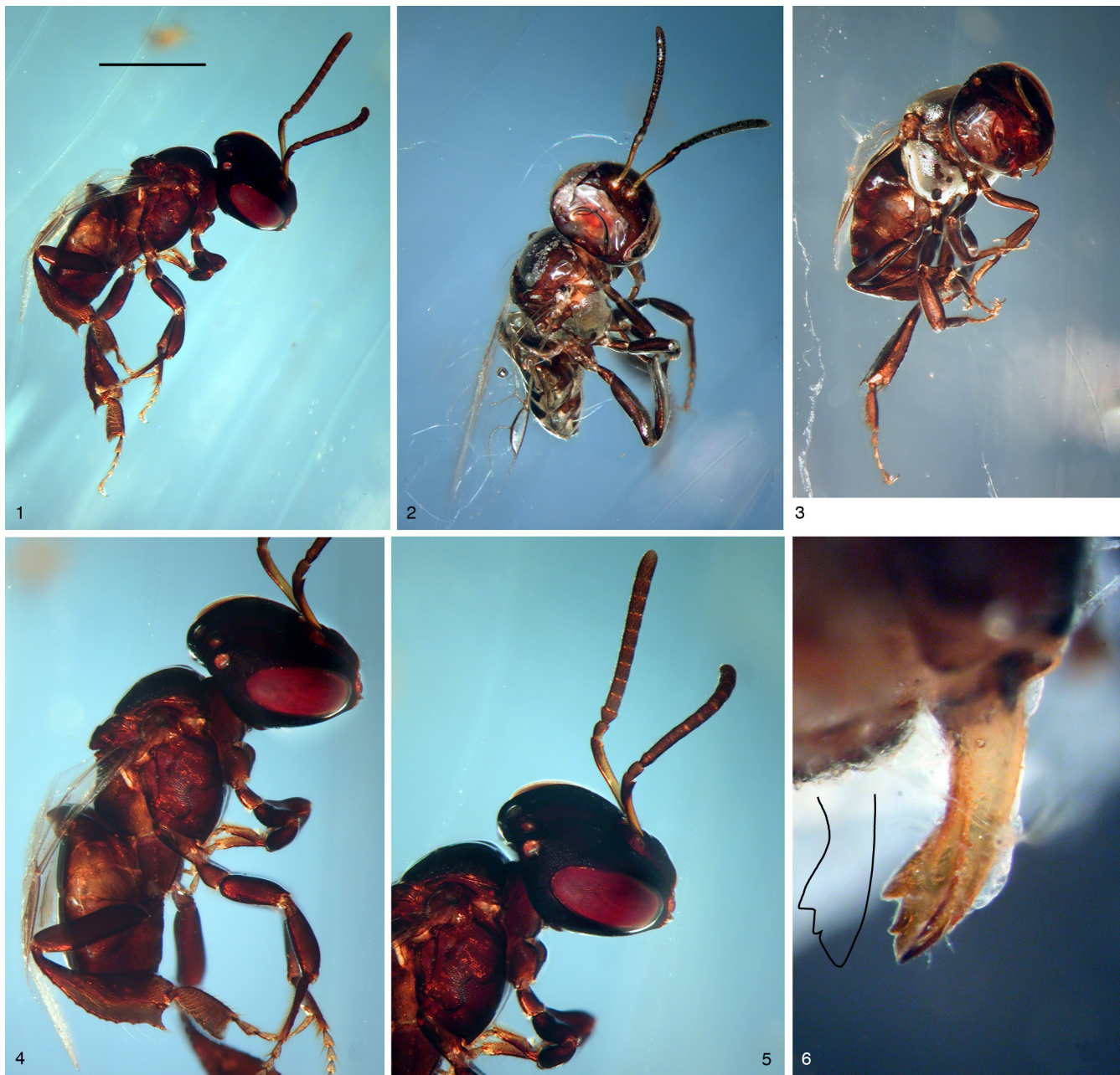
Figure 1. Trigonisca ameliae Penney n. sp. in Quaternary copal from Colombia: 1, holotype (NHM II 3059 [1]), scale bar = 1.0 mm; 2, paratype 1 (NHM II 3059 [2]) showing wing venation; 3, paratype 2 (NHM II 3059 [3]); 4, close-up of holotype; 5, close-up of holotype showing lack of setae on head and antennae; 6, paratype 3 showing left mandible dissected from the head after extraction of the inclusion using chloroform (with trace outline of T. moratoi mandible for comparison) (new).

Included species. — Trigonisca browni (Camargo & Pedro, 2005), T. chachapoya (Camargo & Pedro, 2005), T. clavicornis (Camargo & Pedro, 2005), T. longitarsis (Ducke, 1916), T. martinezi (Brèthes, 1920), T. mendersoni (Camargo & Pedro, 2005), T. moratoi (Camargo & Pedro, 2005), T. rondoni (Camargo & Pedro, 2005), T. schulthessi (Friese, 1900), T. tavaresi (Camargo & Pedro, 2005).