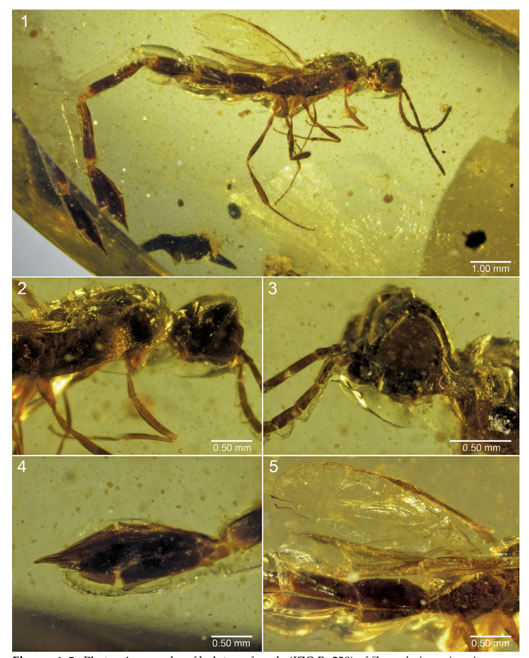
Figures 1–5. Photomicrographs of holotype female (JZC-Bu229) of Zoropelecinus zigrasi , new genus and species. 1. Right lateral aspect of holotype female. 2. Right lateral aspect of head and mesosoma. 3. Left lateral aspect of head. 4. Apicalmost metasomal segment. 5. Basal two metasomal segments and posterior of mesosoma.

appendix. Several of the genera and species described as compressions with trivial differences from the Early Cretaceous of Asia should perhaps be synonymized but this must await a thorough revision of those faunas.