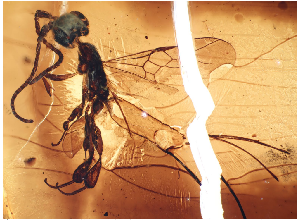
Figure 1. Photograph of holotype female of Zorophratra corynetes , new genus and species, in Early Cretaceous amber from central Lebanon.

syn & Brothers (2009) added several genera and species from Turonian compressions of Botswana, and Perrichot et al. (2011), Perrichot (2013), and Perrichot & Perkovsky (2016), expanded the diversity considerably based on amber inclusions from a variety of ages and localities (Table 1). Vilhelmsen et al. (2010) were able to establish Maimetshidae as thoroughly distinct from Megalyridae and corroborated more conclusively their relationship to Trigonalyidae.