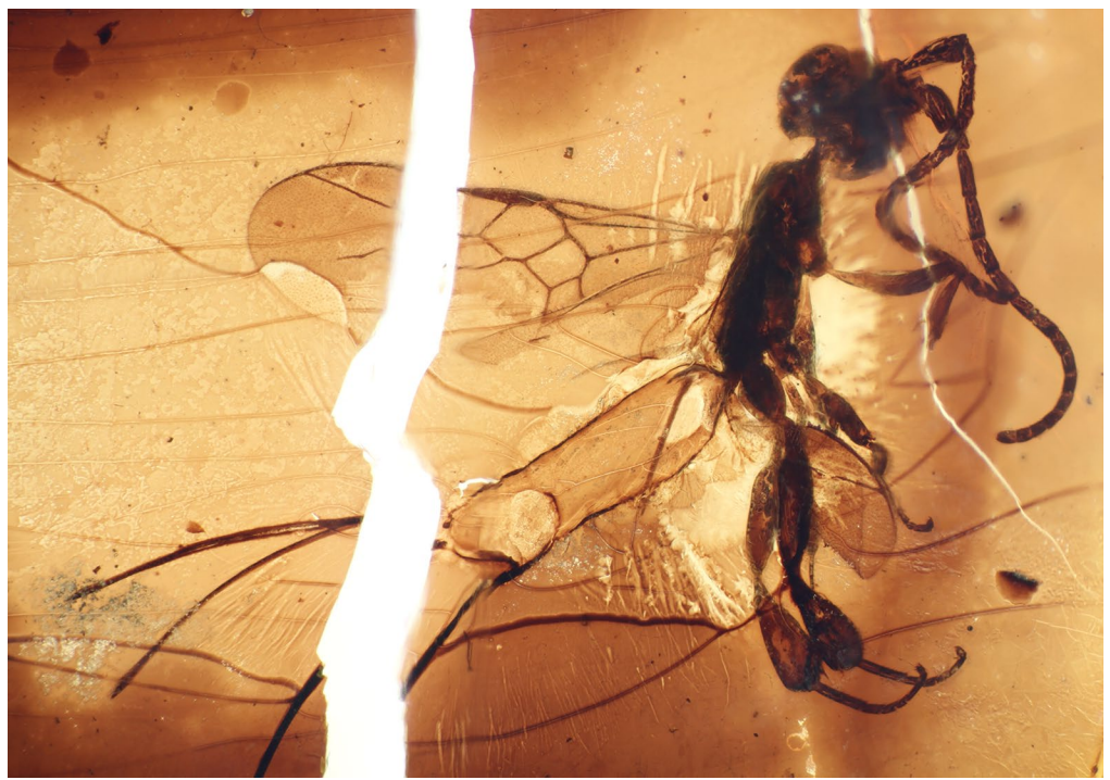
Figure 2. Photograph of holotype female of Zorophratra corynetes , new genus and species, in Barremian amber from Lebanon.

soma; ovipositor elongate. In addition, compound eyes large, slightly bulging; vertex without medial sulcus; occipital carina present; antennal scape longer than wide and widening apically, length approximately 2.2 times apical width; pedicel slightly longer than wide, straight; flagellum with 14 flagellomeres, flagellomeres cylindrical, first flagellomere longest; forewing with two submarginal cells (2rs-m absent), second submarginal cell not petiolate, trapezoidal; 1rs-m nebulous; 2cu-a absent; and protibial calcar arched with apex simple.