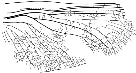
Pharciphyzelus lacefieldi Beckemeyer & Engel, 2011