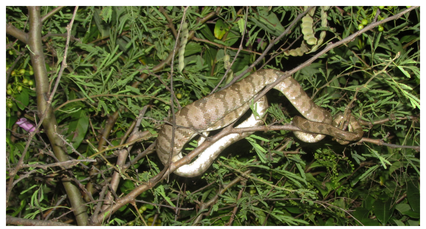
Fig. 6. A resting treeboa with an obvious meal in its stomach. The prey item is likely a rat but possibly a young iguana.

Although we knew that rodents are important in the diet of larger C. grenadensis , this was our first observation of rodent predation in the field, and this particular episode was especially interesting for two reasons. First, we assume the boa was aware of a rodent being in proximity due at least to olfactory information, but also to infrared (thermal) and possibly visual cues. The boa's head and the forepart of its body altered their direction in an instant to capture the rat. This is in sharp contrast to observations of actively foraging treeboas stalking quiescent lizards (Yorks et al. 2003, da Costa Silva et al. 2012; Fig. 9). They move stealthily through the vegetation for prolonged periods, sometimes so slowly that movement is barely discernible, and then grab the resting lizard when within several centimeters. The capture of the rat, on the other hand, required rapid information processing and a