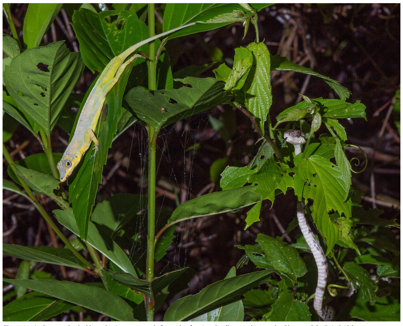
Fig. 9. An Anolis aeneus that had been sleeping a moment before with a foraging Corallus grenadensis nearby.

that we might have serendipitously chosen a time of optimal conditions was the number of boas that appeared to have recently fed. Regardless of the reason for the abundance of snakes we encountered, it was a memorable experience.