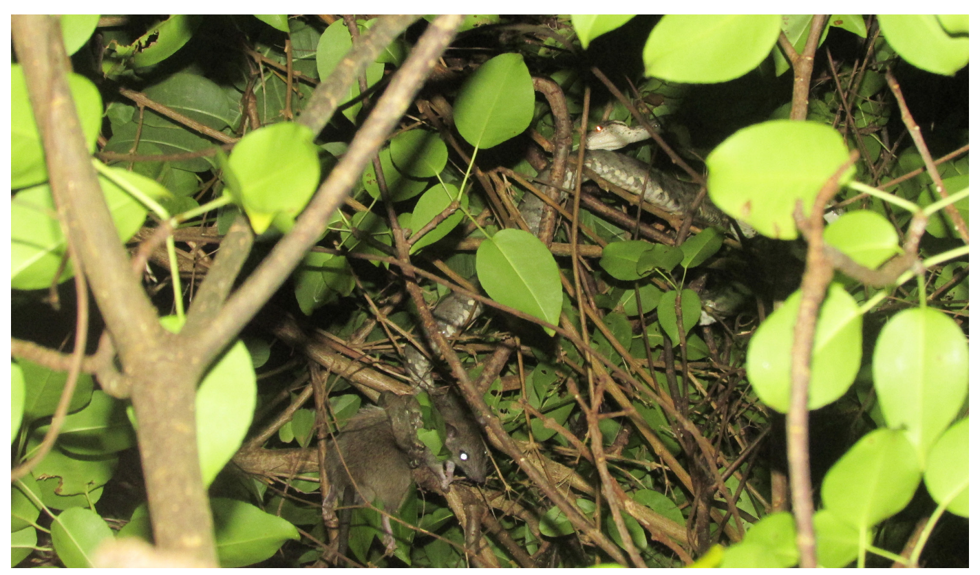
Fig. 8. The adult Corallus grenadensis with the recently captured rat that caused such great excitement.

Did we just happen to hit on a couple of good nights when conditions were optimal (or close to optimal) for C. grenadensis activity? Possibly. Keep in mind that the night before the 51-boa night we found 27 at a far-removed site for a total of 78 treeboas over two nights. Both the September and October searches occurred during the rainy season and, although it did not rain during our searches, it had rained earlier in the day on all three days. During the September hunt the moon was approaching full and in late October we worked under a waning crescent, so we cannot implicate moon phase one way or the other. Relative to other C. grenadensis habitat in which we had worked, nothing was visually remarkable about the habitat at X or Y . One indication