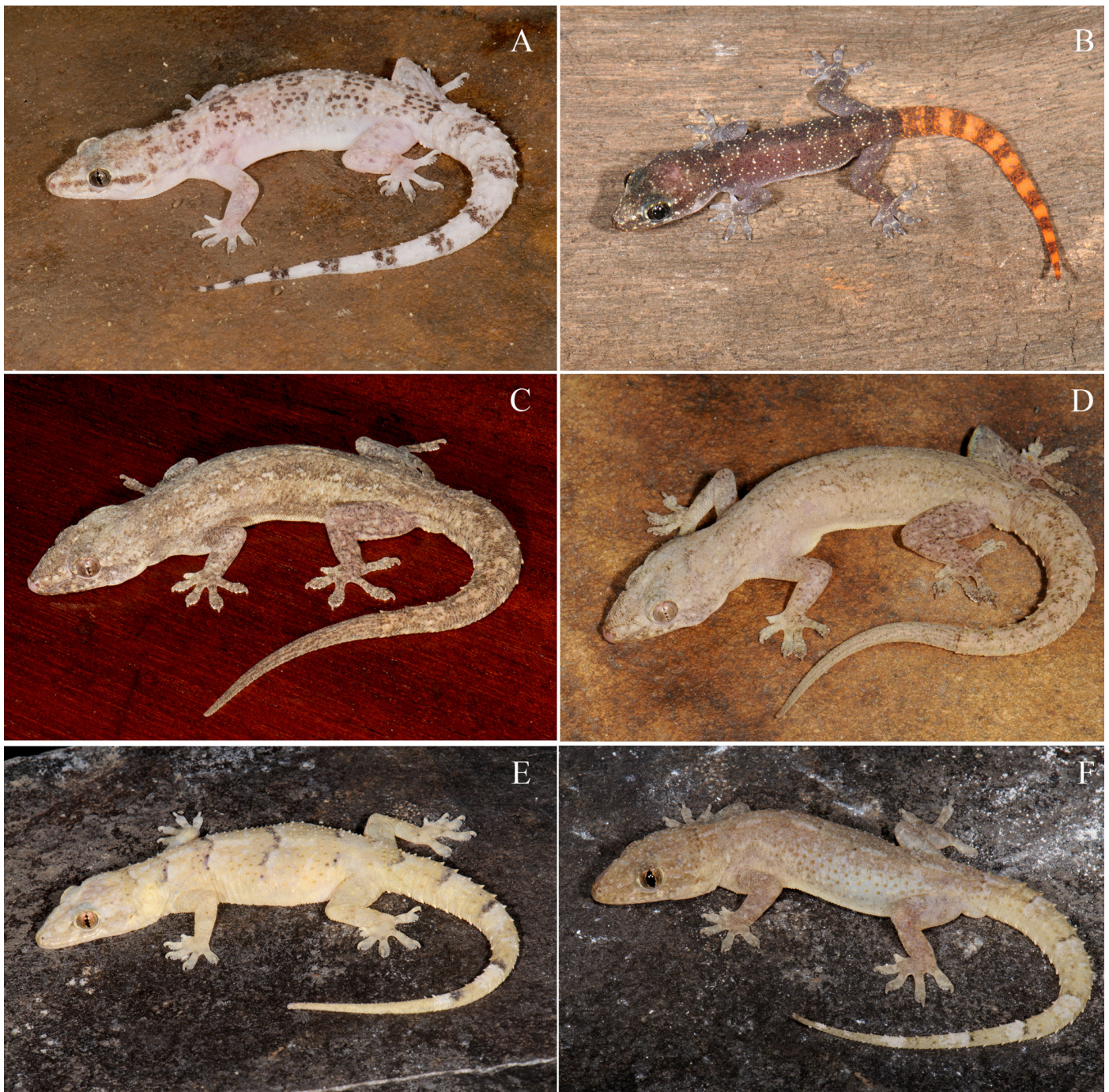
Fig. 1. Three species of Hemidactylus now established in Cuba: (A) Hemidactylus angulatus , adult male from Lawton, La Habana, with distinctive dark banding; (B) H. angulatus , juvenile from same locality (note the X-shaped dorsal figures surrounded by paler tubercles); (C) H. frenatus , adult male (MNHNCu 5060) from Hotel Husa Cayo Santa María, Cayo Santa María, Villa Clara, with obvious longitudinal dark zones and interspersed light spots; (D) H. frenatus , same male in light phase; (E) H. mabouia , adult female, from Lawton, La Habana, with a typical chevron pattern; (F) H. mabouia , adult male, same locality, with a poorly defined pattern.

to verify the presence of H. frenatus in nearby hotels and other tourism facilities on the cay. The presence of H. frenatus on Cayo Santa María and at the Naval Base at Guantánamo likely reflect two different pathways of introduction.