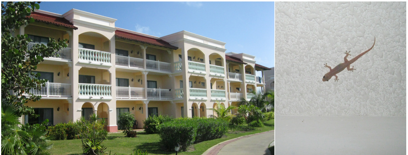
Fig. 2. Partial view of the Hotel Husa Cayo Santa María, Villa Clara Province (left), where Hemidactylus frenatus (right) was commonly seen on building walls, roofs, and around electric lights.