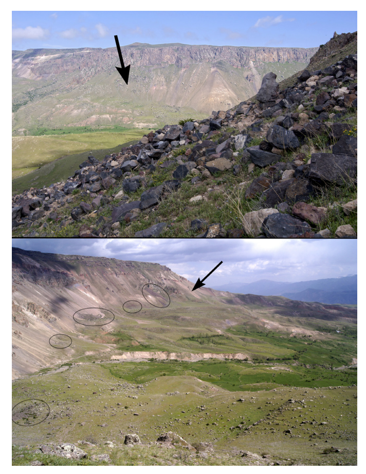
Fig. 6. Upper image: View from a site where we found several Radde's Mountain Vipers ( M. raddei ; foreground) to ca. 2 km straight distance across the Günindi Valley, Kars Province, to the slope where we found Wagner's Mountain Vipers ( Montivipera wagneri ; black arrow). Lower image: Counterview from the M. wagneri site (rocks in the foreground, bottom of image) across the valley to where M. raddei was found (black arrow). The black arrows point also to the location from where each of the photographs was taken. Elliptical markers indicate rock formations that are sufficiently complex and have at least a partial southern exposure that could function as stepping-stone sites between the populations of the two mountain viper species.

The entire transition zone of mineral soils might represent a population density trough (i.e., an area into which individuals of either species could migrate and live in sympatry or even syntopy), while the density of both remains too low to have a relevant impact on the neighboring populations of either species. As one continues deeper into the Günindi Valley, the canyon becomes narrower and the cliffs and slopes occupied by M. raddei angle increasingly more to the north, and are thus cooler due to the reduction in direct solar radiation. The canyon extends approximately 3 km to the village of Keşişkıran, where the cliffs end and are replaced by more gradual slopes, plateauing at >2,200 m above sea level (asl), a habitat less suitable for either species of Montivipera . Additional on-site research is needed to evaluate whether the perceived correlation of soil types with viper presence is