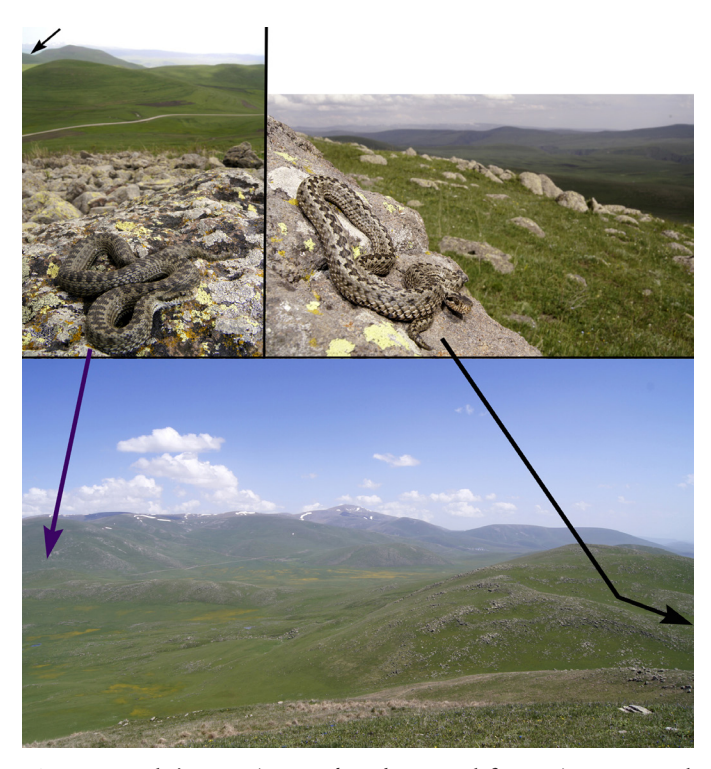
Fig. 7. Darevsky's Viper ( Vipera darevskii ; upper left image) in its natural habitat, a large rock slide in eastern Hanak District, Ardahan Province; in the background, rolling hills where the Armenian Steppe Viper ( V. eriwanensis ; upper right image) was found north of Binbaşak. The lower image shows the potential contact zone between these two highland dwarf vipers; arrows point to where the V. darevskii from the upper left image (violet) and the V. eriwanensis (700 m in the direction of the black arrow) were found in 2015.

Recent studies demonstrated that the two dwarf viper species occur at sites around Posof in eastern Ardahan Province, Turkey, and across the border in Georgia (Avci et al. 2010; Tuniyev et al. 2012, 2014). After discovering several new populations of V. darevskii a little farther south in eastern Hanak District, Ardahan Province (Göcmen et al. 2014; Mebert et al. 2015), we focused our search in 2015 on a potential contact zone between the two species near the neighboring villages of Oğuzyolu, Börk, and Binbaşak. We found an individual V. darevskii southeast of Oğuzyolu (Fig. 8) and, more importantly, a V. eriwanensis north of Binbaşak. The two new discoveries reduced the straight-line distance between the ranges of these species from 8 km (Mebert et al. 2015) to 4.5 km. The zone of transition or contact between