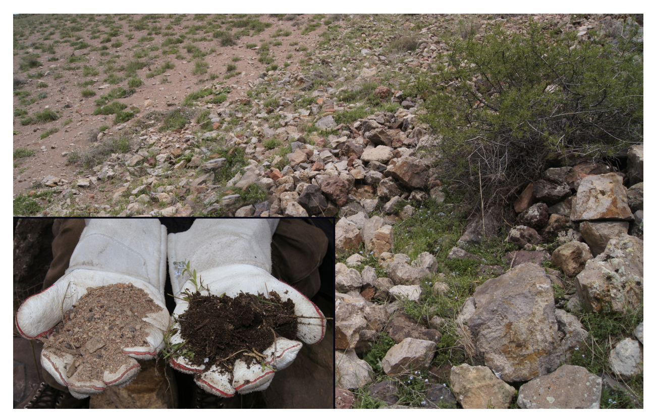
Fig. 4. Adjacent patches of mineral soils (left on the gloves and in the background image) versus dark organic soils (right side) appear to influence the habitat quality in the transition zone between Wagner's Mountain Viper ( Montivipera wagneri ) and Radde's Mountain Viper ( M. raddet ). Vipers were found only in areas with organic soils, as evident in front of the bush visible on the right.

Fig. 3. Google<sup>®</sup> image showing "The Valley of Four Viper Species" and the transition zone between known localities of Wagner's Mountain Viper ( Montivipera wagneri ) and Radde's Mountain Viper ( M. raddei ) with a contact zone likely occurring along the stream in the valley. The yellow markers represent M. wagneri records and the pink markers M. raddei (photographs of both species from this area are depicted in Fig. 5). Also indicated are records of Vipera eriwanensis (light blue markers and upper inset) and Macrovipera lebetina (black markers and lower inset) with all four species found within <1.2 km of the white marker.