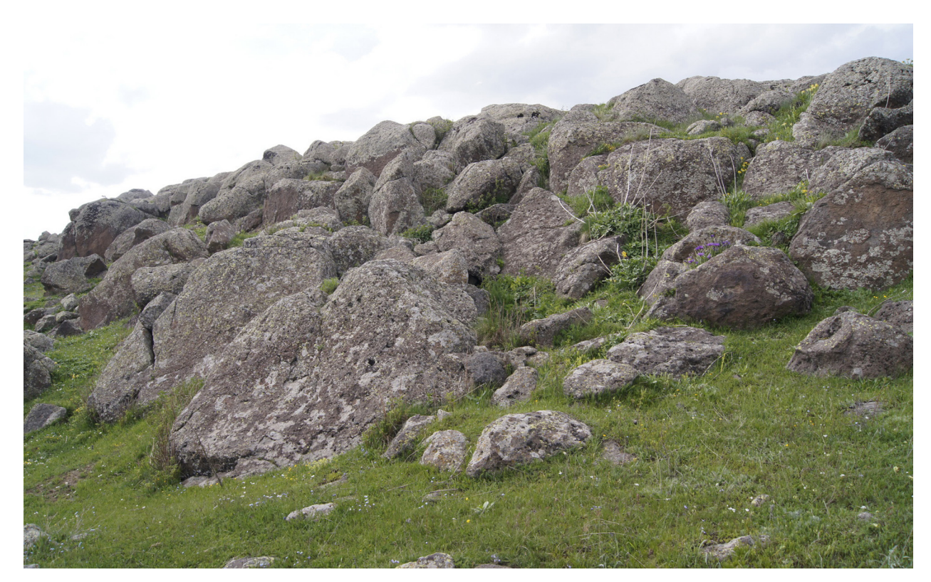
Fig. 9. One of the few extensive rock formations in the rolling-hills habitat of the Armenian Steppe Viper ( V. eriwanensis ) at Binbaşak, Ardahan Province; the individual in Fig. 7 was found in the middle of this formation. The meadows around such rock formations are heavily grazed with only the less accessible sites between the rocks maintaining some higher tufts of grass and herbaceous vegetation.

Fig. 8. Google<sup>©</sup> image showing the transition zone between the ranges of Darevsky's Viper ( Vipera darevskii ; violet markers) and Armenian Steppe Viper ( V. eriwanensis ; light blue markers), including our 2015 discovery of V. darevskii (marker with arrow) and data from Göçmen et al. (2014), Tuniyev et al. (2014), and Mebert et al. (2015).