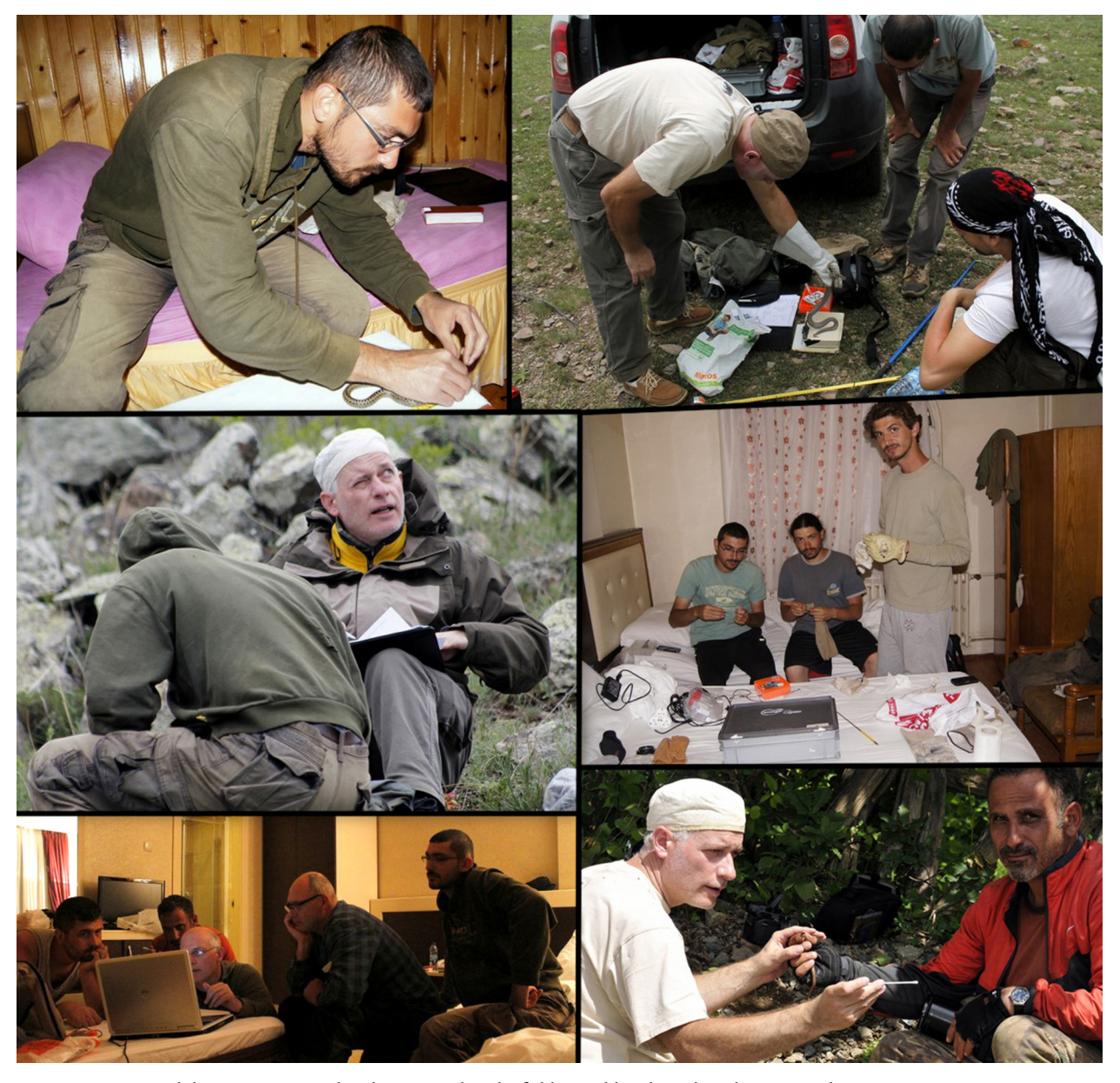
Fig. 2. Processing vipers and data acquisition in hotel rooms and in the field on cold and windy or hot, sunny days.

During the 2015 expedition, we continued to explore the Günindi Valley and detected four different species of vipers within a 1.2-km radius, and subsequently termed this area "the Valley of Four Viper Species" (Fig. 3). We added 10 new records from this valley and adjacent areas for M. raddei (captures, shed, and observations) and four for M. wagneri (captures and observations). Accordingly, we reduced the surface distance between both mountain vipers from 6.7 km to 2.4 km. No clear barrier or obstacle has been found between the nearest localities for the two species, and several intervening rock piles or formations could serve as stepping-stone habitats. The stream on the valley floor is only 2–7 m wide and rarely more than 50 cm deep and thus unlikely to pose an effective barrier between adjacent M. wagneri and M. raddei populations. However, as Mebert et al. (2015) indicated,