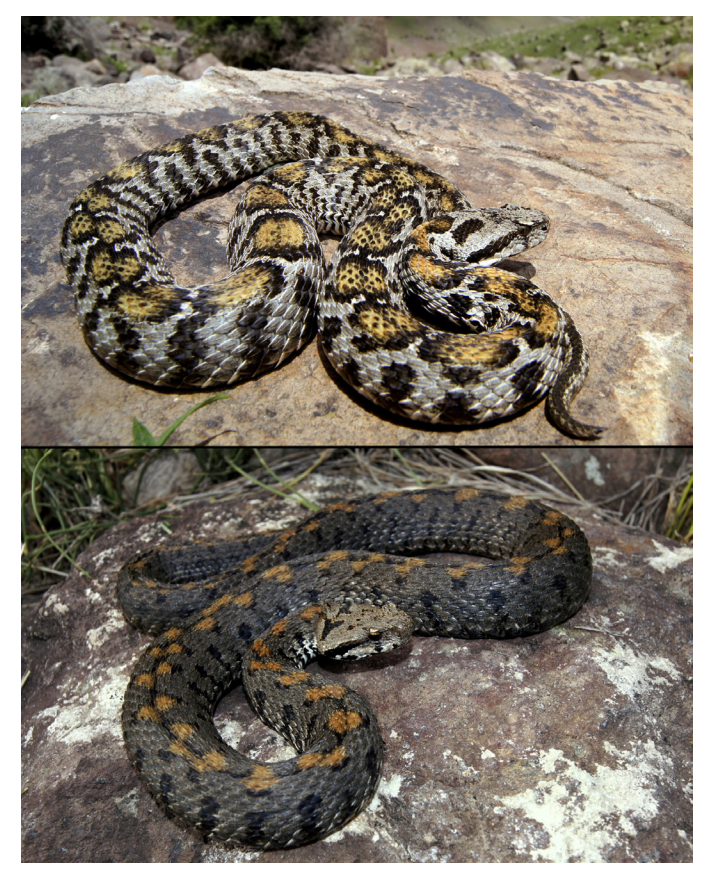
Fig. 5. Mountain vipers from the transition zone near Günindi, Kağızman, Kars: Wagner's Mountain Viper ( Montivipera wagneri ; upper image) and Radde's Mountain Viper ( M. raddei ; lower image). The distance between these two snakes was ca. 6 km, but we found individuals of the two species as close as ca. 2 km (see also Figs. 3 and 6).

organic soil. Nonetheless, the suboptimal transition zone likely provides sufficient habitat for survival and corridors for migration between the two viper species, as numerous rock slides and piles lie in close proximity (<500 m) to each other and to horizontal rocky outcrops or cliffs along the upper margin of this zone. As Ettling et al. (2013) indicated, M. raddei in a steppe/cropland habitat in Armenia moved seasonally between sites that were 1-3 km apart. Consequently, even though the transition zone at our study site (<10 km) appears comparatively less favorable, it likely is sufficient for migration or movement of individuals of either species. However, any potential gene flow might be countered by competition from the other species, either by genetic swamping via hybridization, higher fitness by the locally dominant species, or both. For example, an individual M. raddei migrating a few km into a population of M. wagneri is unlikely to find a conspecific mate. If it were to hybridize and resulting F1-hybrids were fertile, they would encounter only a M. wagneri gene pool, thus further diluting the impact of that individual M. raddei. This scenario would work the other way as well (if an individual M. wagneri migrated into M. raddei habitat) and assumes that both species survive equally well in