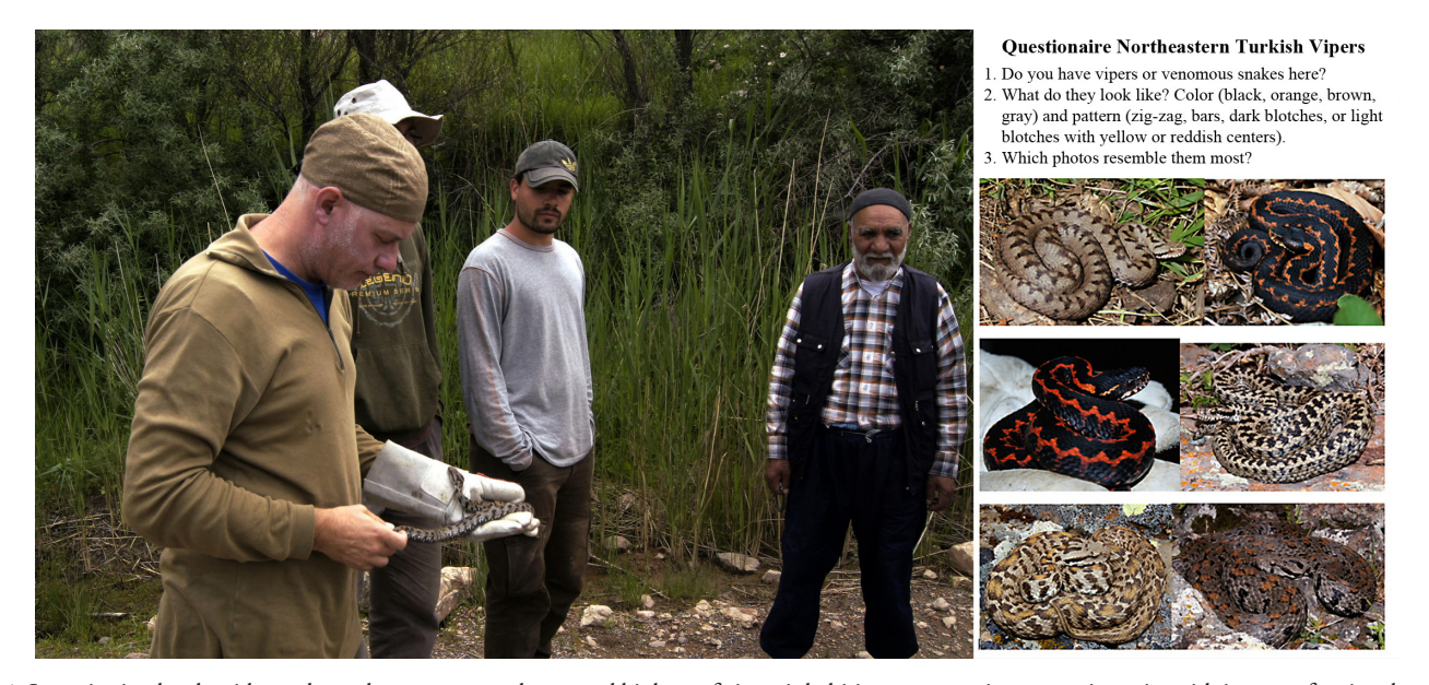
Fig. 1. Interviewing local residents about the occurrence, threat, and biology of vipers inhabiting an area using a questionnaire with images of regional species.

than 100 km<sup>2</sup> and habitat of <10 km<sup>2</sup> in Armenia alone, with a similar situation in Turkey (Aghasyan et al. 2009; Tuniyev et al. 2009a; Mebert et al. 2015); (4) Vipera eriwanensis (Armenian Steppe Viper): Vulnerable; known from approximately 14 areas in Turkey and a few more in Georgia and Armenia (e.g., Tuniyev et al. 2009b; Mebert et al. 2015).