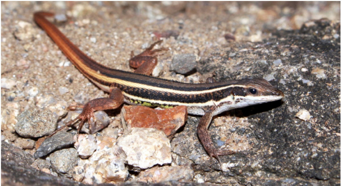
Fig. 1. Leschenault's Snake Eye, Ophisops leschenaultii (Milne-Edwards 1829) from the Kawal Tiger Reserve, Adilabad District, Telangana State, India.

divergence suggest a late Miocene diversification within the genus (Kyriazi et al. 2008). Although that phylogenetic study focused on the two Mediterranean species ( O. elegans and O. occidentalis ), one individual of O. jerdonii collected in India was included in the study. It showed a high degree of divergence from all other clades. Studies pertaining to the genus Ophisops in the Indian subcontinent, like those more broadly in Asia, are still in a nascent stage.