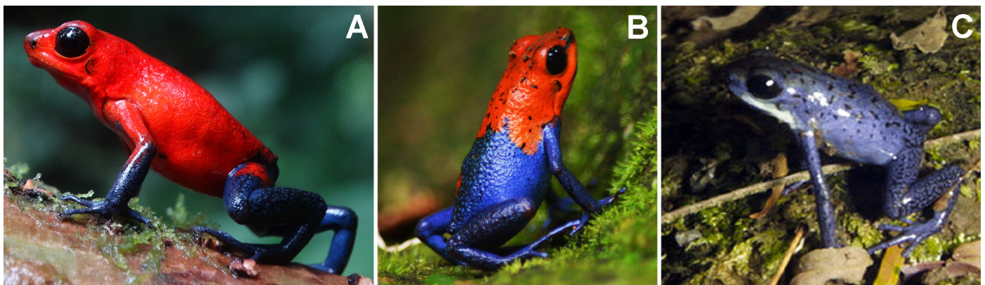
Fig. 1. Strawberry Poison Frogs ( Oophaga pumilio ) from north of the Río Reventazon; these are representatives of the northern clade (see text). (A) Typically colored morphs from north of the Río Reventazon. (B) An aberrant color pattern encountered at the La Selva Biological Station, Heredia Province, Costa Rica. (C) An aberrant blue individual at La Selva.

Guyer and Donnelly (2005) noted the presence of a blue frog but provided no further data. O. Vargas photographed that individual (Fig. 1C) on 17 September 1999 after it was captured by Brian Plaster and Jimmy Trejos, two primatolo-