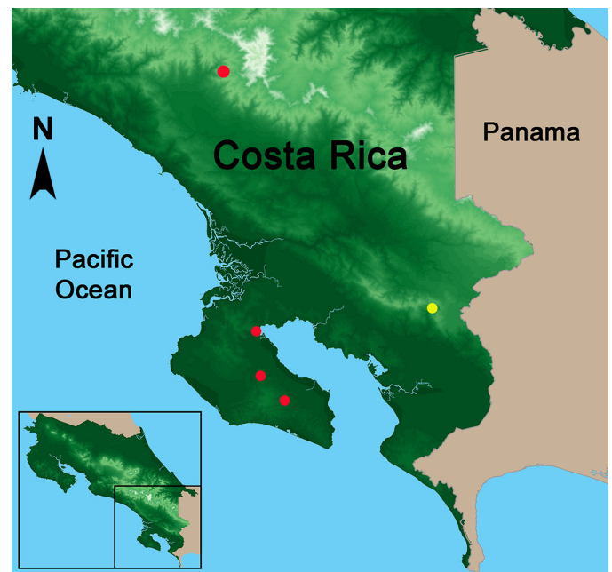
Fig. 1. Distribution of Savage's Anole ( Dactyloa savagei ) in southern Costa Rica. The yellow dot marks the type locality and red dots indicate confirmed and new localities for the species. The elevational distribution ranges from about 224 m in La Tarde on the Península de Osa to 1,690 m at the Cloudbridge Reserve near Cerro Chirripó.

CBA examined the specimen from Ballena (BMNH 1909.7.10.20) from photographs sent by Patrick Campbell, Reptile Curator at the British Museum. This locality is not precise (Ballena is a beach 8 km SE Uvita, Puntarenas Province, and also is an alternative name of the town of Bahía Ballena, also in Uvita). The locality is represented in maps in Savage and Talbot (1978), Savage (2002), and Poe and Ryan (2017) as in Uvita. Both are close to the sea, and the elevation of 4 m asl is correct. However, the specimen is not Dactyloa savagei , as it lacks a postorbital dark blotch, instead bearing the large pale-centered, dark-outlined blotch between the