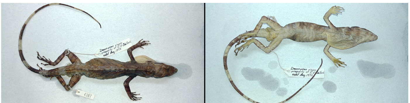
Fig. 3. An adult male Savage's Anole ( Dactyloa savagei ; UCR 4387), from Rincón de Osa, Peninsula de Osa, Puntarenas Province, Costa Rica, that had originally been identified as Dactyloa insignis.