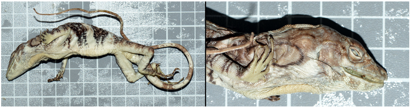
Fig. 2. A Decorated Anole ( Dactyloa insignis ; BMNH 1909.7.10.20) from Ballena in Puntarenas Province, Costa Rica (elev. 4 m asl). We herein corroborate the identity of this specimen but suggest that the locality is in error as it lies well outside the known range of the species.