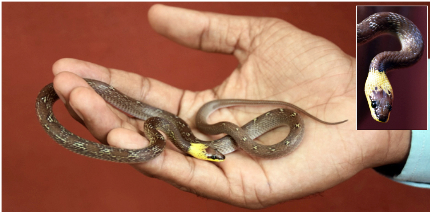
Fig. 2. A rescued Yellow-collared Wolfsnake ( Lycodon flavicollis ) in the Tadbun Area, Hyderabad, Telangana, India. Note the wide yellow collar that extends to the back of the head.