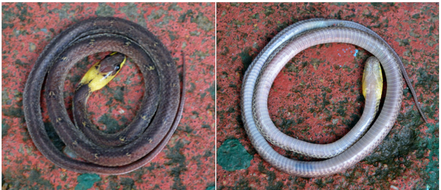
Fig. 3. Dorsum (left) and venter of a Yellow-collared Wolfsnake ( Lycodon flavicollis ) from the same locality as that in Fig. 2.