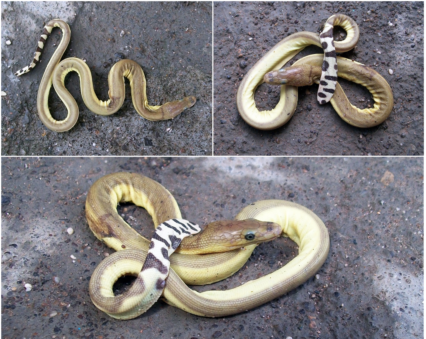
Fig. 2. A juvenile albinotic Yellow-bellied Sea Snake ( Hydrophis platurus ) from Magdalla, Surat District, Gujarat, India.