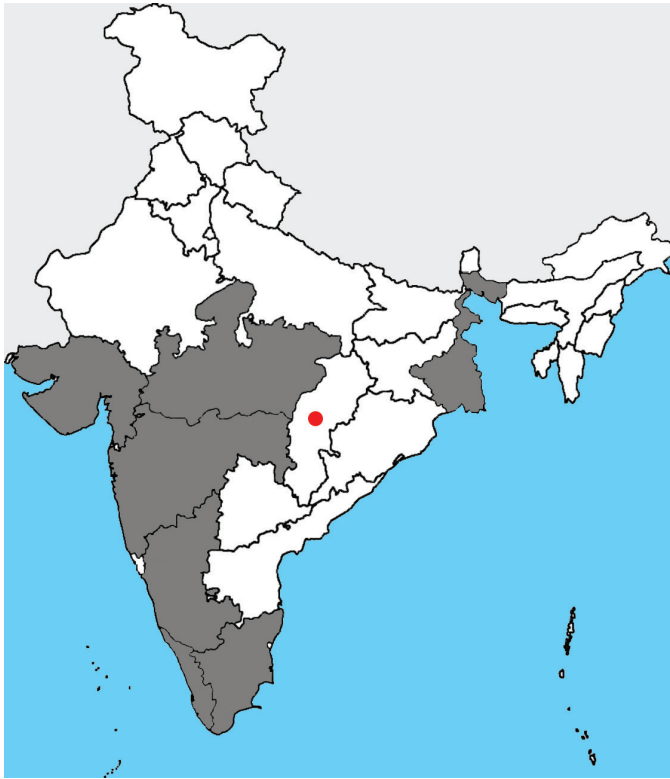
Fig. 2. Map of India showing states with records of Slender Coralsnakes ( Calliophis melanurus ) in dark gray. The site of the new Chhattisgarh state record in Durg is marked with the red dot.