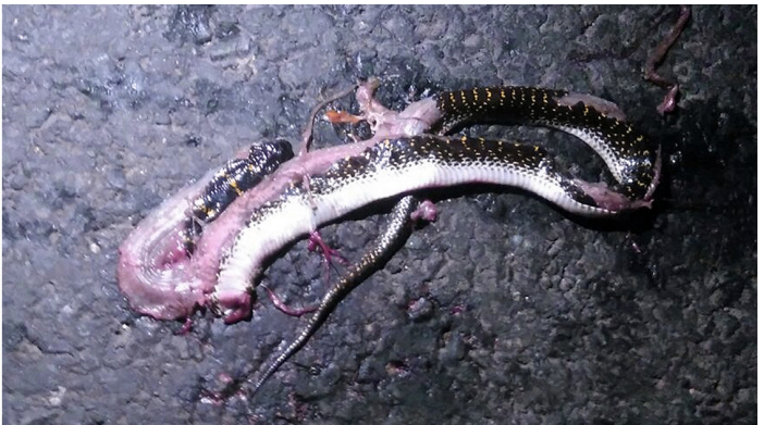
Fig. 3. A young Yellow-spotted Wolfsnake ( Lycodon flavomaculatus ) collected on 20 October 2017 in Khairagarh, Chhattisgarh, India (left) and a road-killed, unsexed individual found on 22 October 2017 in Durg, Chhattisgarh, India. These represent the first confirmed records of the species in Chhattisgarh. Durg is the easternmost recorded locality for the species in India.