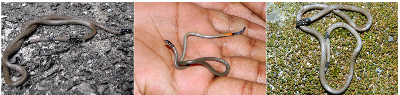
Fig. 1. Slender Coralsnakes ( Calliophis melanurus) collected in the vicinity of Durg, Chhattisgarh, India: an adult male taken on 7 December 2017 (left), a juvenile male on 9 December 2017 (center), and an adult female on 12 December 2017 (right). These represent the first records of the species in Chhattisgarh.