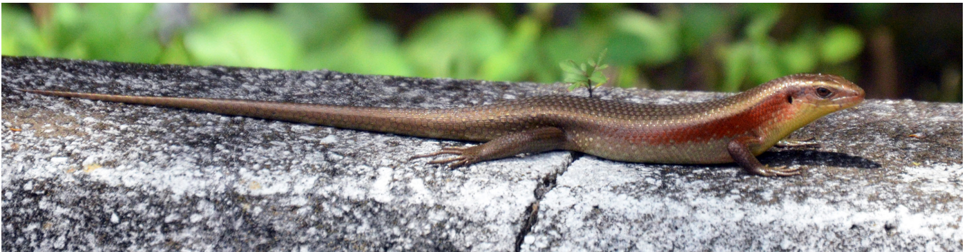
Fig. 3. Lateral view of an adult male Many-lined Sun Skink, Eutropis multifasciata (UF-Herpetology 184867), from Davie, Broward County, Florida.

observed skinks on the ground and perched in slightly elevated positions on root systems and piles of vegetation. The highest perch site was approximately 1 m above the ground on a fallen tree trunk.