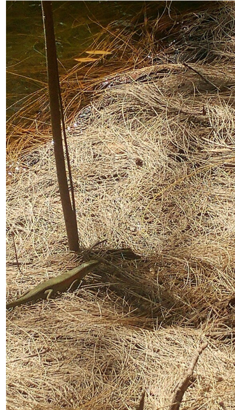
Fig. 1. In situ photograph of an adult male Many-lined Sun Skink, Eutropis multifasciata (UF-Herpetology 184865), from Davie, Broward County, Florida.

females between 1518 h and 1729 h, expanding the known distribution in this area to the east and south, and slightly north and west (Fig. 4). Walter E. Meshaka, Jr. verified the identity of the species and confirmed the sexes of photographed individuals. Additional habitat types were palm plantations with sparse understory consisting mostly of detritus; clearings with thick, green, low-growing plant cover; and hardwood hammocks overgrown with broad-leafed vines. We