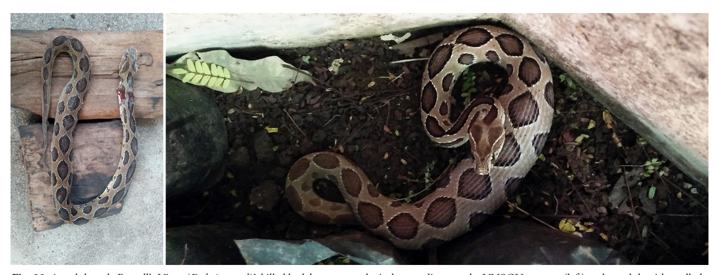
Fig. 22. An adult male Russell's Viper ( Daboia russellis ) killed by laborers near the indoor stadium on the VNSGU campus (left) and an adult with a telltale bulge indicative of a recent meal (right).

Russell's Vipers are usually nocturnal. They occupy open grasslands, scrub jungle, forests, thorny hedgerows, mangrove stands, and rocky areas. Females bear 6–63 live young from May to July (Whitaker and Captain 2008). In the Solapur District of Maharashtra, a female is reported to have given birth to 96 young in June (Habib and Cheda 2010).