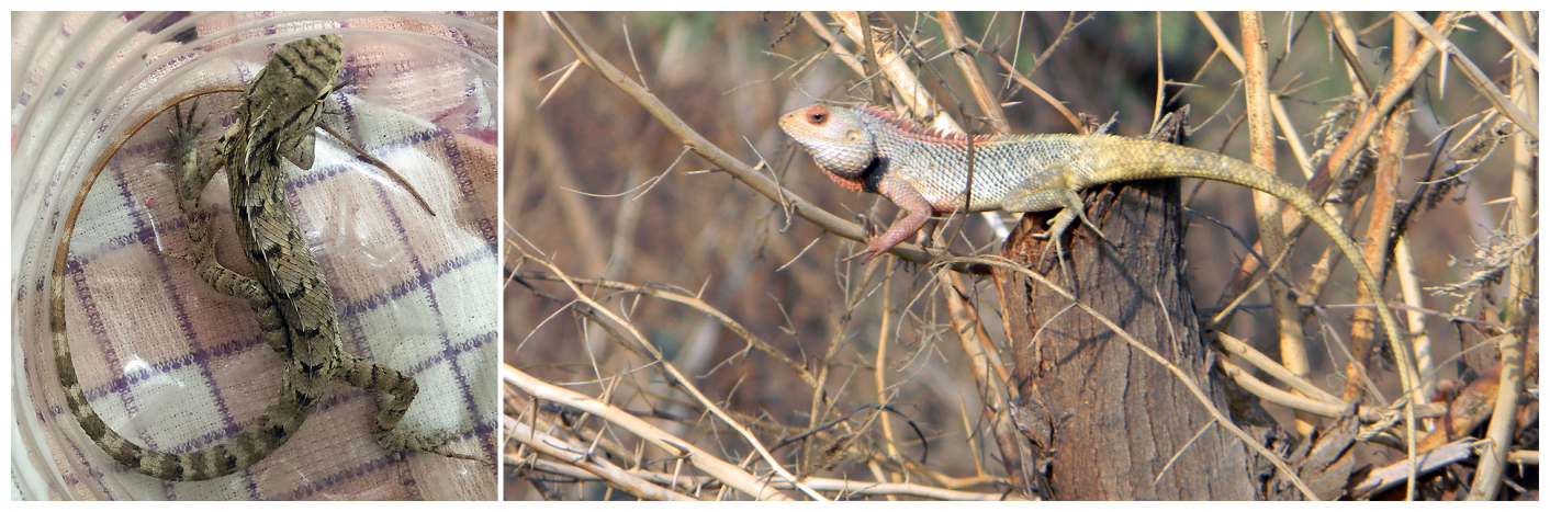
Fig. 5. An adult Indian Garden Lizard ( Calotes versicolor ) rescued from the cafeteria (left) and an adult male in breeding colors (right).