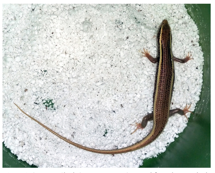
Fig. 8. A Common Skink ( Eutropis carinata ) rescued from the microbiology lab of the Department of Biosciences.

These rarely seen small lizards (maximum recorded length = 255 mm, of which ~60% is tail; Vyas 2014) with elongated snake-like bodies inhabit scrubland, agricultural areas, urban gardens, and forests, where they burrow in loose soil and under large boulders (Vyas 2014).