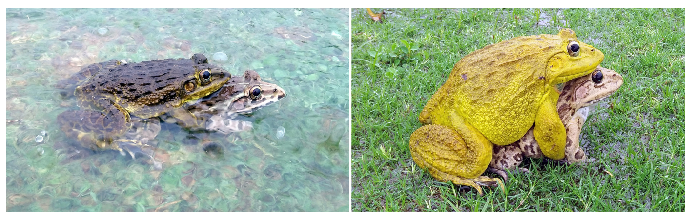
Fig. 29. Two pairs of Indian Bullfrogs (Hoplobatrachus tigerinus) in amplexus.

Smooth Snake, Schneider's Dwarf Toad, Indian Marbled Toad, Long-legged Cricket Frog, and Ornate Narrow-mouthed Frog. Furthermore, additional species not included in this report are found occasionally in adjacent areas and