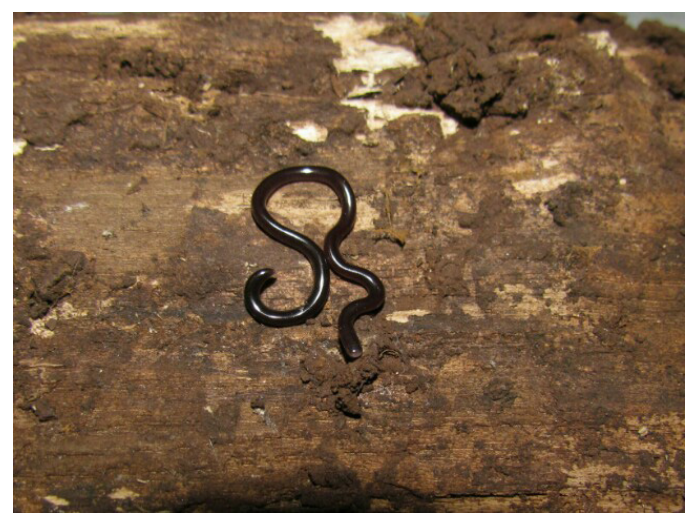
Fig. 10. The Brahminy Blindsnake ( Indotyphlops braminus ) is the smallest snake found at VNSGU.

The Brahminy Blindsnake is one of the smallest snakes in India (maximum recorded length = 230 mm; Whitaker and Captain 2008). The tiny spine at the end of the blunt tail is used as an anchor when burrowing (Desai 2017). As a result of inadvertent transport with ornamental plants, these snakes now have a circum-tropical distribution (Whitaker and Captain 2008). Often associated with rootballs, snakes frequently are found in flowerpots (and are sometimes called