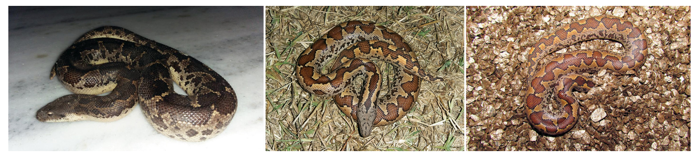
Fig. 11. A large adult Common Sand Boa ( Eryx conicus ; left), a juvenile (center), and an individual burrowing in the substrate while held in captivity (right).