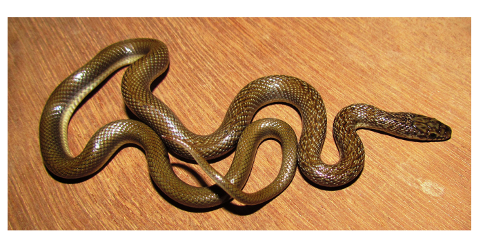
Fig. 14. First record of a rare Indian Smooth Snake ( Coronella brachyura ) from the M.Sc. (IT) department at VNSGU.

This mild-tempered species is endemic to India where it hunts actively, largely during crepuscular periods (Whitaker and Captain 2008).