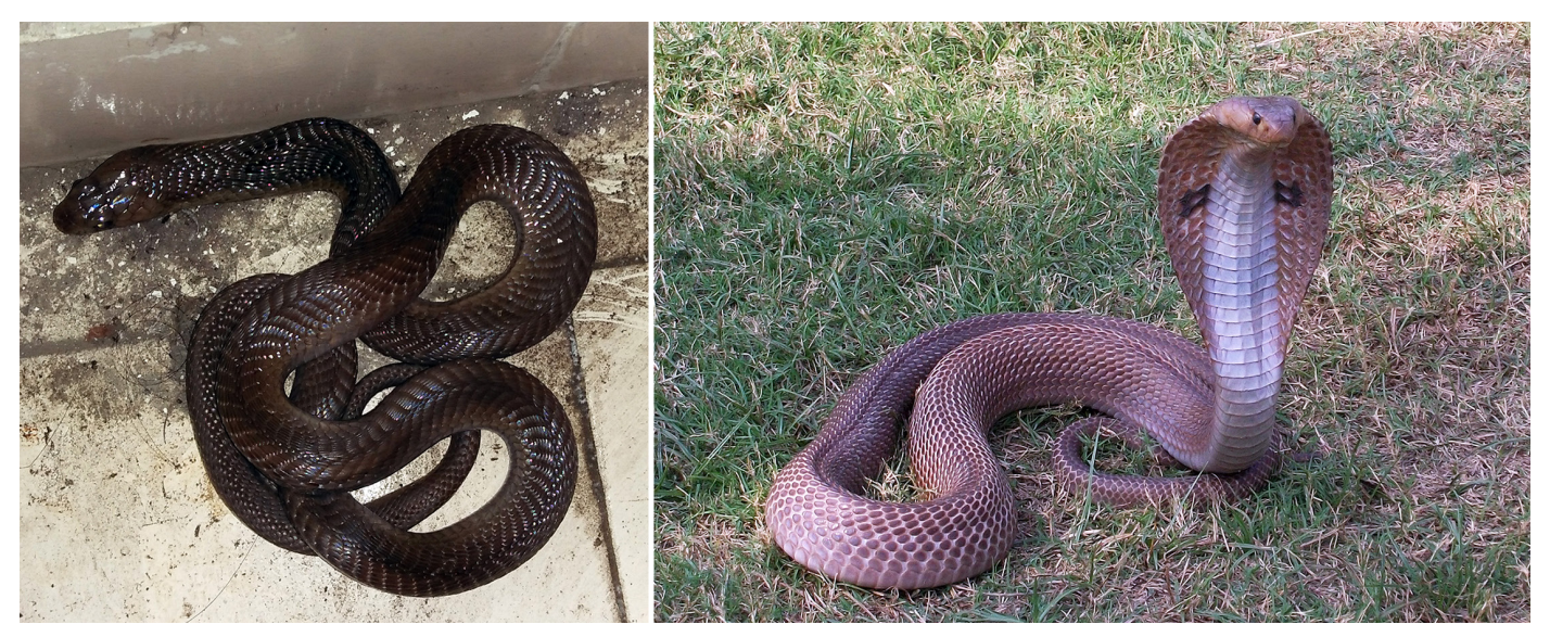
Fig. 21. An Indian Cobra (Naja naja) found near the last bench in a classroom of the M.Sc. (IT) Department (left) and an adult hooding (right).