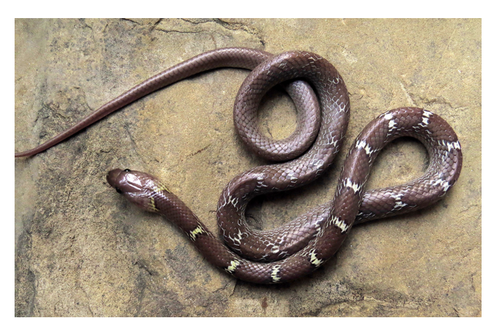
Fig. 16. The Common Wolfsnake ( Lycodon aulicus ) is frequently encountered in Surat City but is uncommon on the VNSGU campus; this individual was found during a field survey at night.

Nonvenomous and uncommon on the VNSGU campus, Common Wolfsnakes vary considerably in dorsal coloration, with a light to dark glossy brown, dark gray, or black ground color punctuated with yellow or whitish crossbars (Desai 2017; Whitaker and Captain 2008). Frequently found near