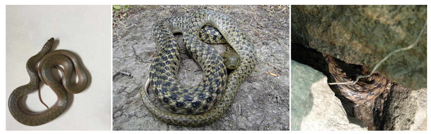
Fig. 17. A Checkered Keelback ( Xenochrophis piscator ) with pinkish spots rescued from the VNSGU campus (left), a more typically colored individual (center), and an individual found beneath a stone (right). Photographs by Dr. S.K. Tank (left, right) and D.S. Parmar (center).

Buff-striped Keelback, Amphiesma stolatum (Fig. 18): We found 13 individuals during the monsoon season in gardens, on roads and in parking lots, in departments near the cafeteria, near the gate, and near the stadium – almost everywhere on campus. Six individuals were at the Bapalal Department at 0912 h on 5 July 2018. One was on a wet road near the Human Resources Department at 0031 h on 21 July 2018. The gate keeper at the gate near the convention hall found a snake on 30 August 2018. One gravid female with eggs was found dead on the road adjacent to the Aquatic Department at 1512 h on 20 September 2018. Another road-killed individual was near the Department of Computer Sciences at