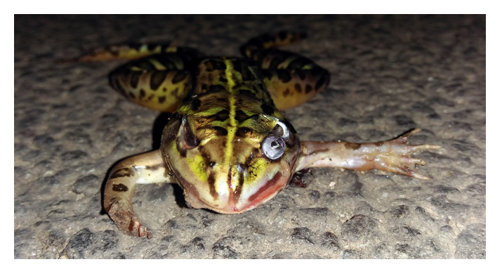
Fig. 32. A road-killed Indian Bullfrog ( Hoplobatrachus tigerinus ) found on the VNSGU campus.

sustain microhabitats by not burning or removing leaf litter, termite mounds, and other types of cover objects, and projects like this herpetofaunal assessment, all in an effort to promote the conservation of our environment. We also appeal to all educational institutions to raise awareness among staff and students and solicit their help to preserve remaining green spaces and the natural communities they support.