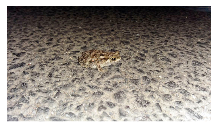
Fig. 25. A Schneider's Dwarf Toad ( Duttaphrynus scaber ) found during a field survey at night.

These toads are frequently encountered during rainy nights. At 1251 h on 16 April 2018, we found a small toad on the road near the Girnar Men's Dormitory. To the best of our knowledge this is the first record of this toad in the Surat District. On a rainy night, another toad was calling.