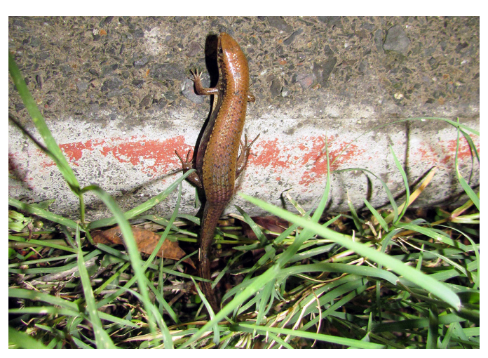
Fig. 9. A gravid female Bronze Skink ( Eutropis macularia ) found near the convention hall.

This species was previously assigned to the genus Mabuya . Bronze Skinks are widely distributed in India and commonly encountered on campus, where we found them in gardens and forested areas, hiding in mud crevices and walls, in grass, and on and under stones. Color and pattern are quite variable, with or without dark dorsal spots on a bronze to brown ground color. Females lay 3–4 eggs (Daniel 1983).