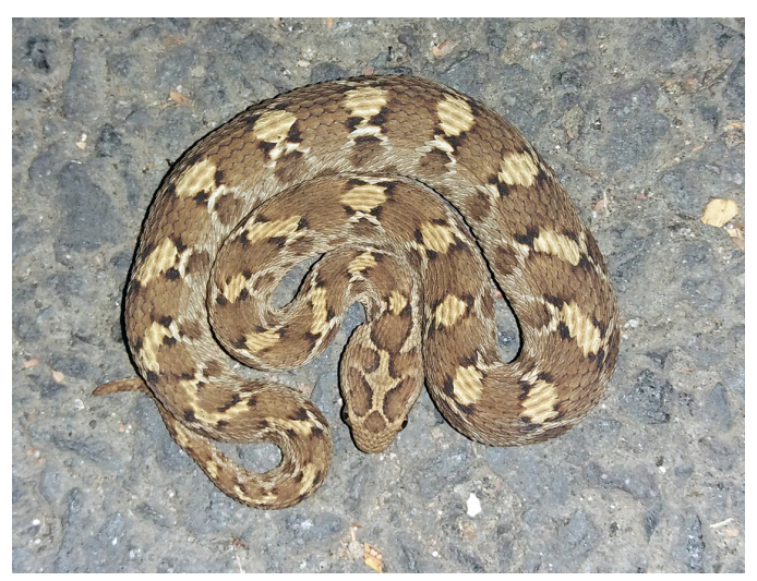
Fig. 23. This Saw-scaled Viper ( Echis carinatus ) was found at night by a security guard who called the snake rescue.

Mainly nocturnal, Saw-scaled Vipers occur in open dry, sandy or rocky terrain in the plains and hills and also in open rocky region with heavy rainfall (Desai 2017; Whitaker and Captain 2008). When alarmed they rub saw-edged scales together to make a rasping sound and will strike quickly when provoked. Females bear from 4–8 live young from April to August (Whitaker and Captain 2008).