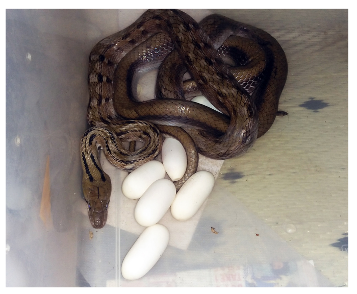
Fig. 12. A gravid female Trinket Snake ( Coelognathus helena ) had been searching for an egg-laying site at night; it subsequently laid ten eggs.

rescued from the gate of an indoor stadium at 1812 h on 2 June 2018. The fifth snake, a gravid female found at 1215 h on 12 September 2018, was the largest (total length = 1,473