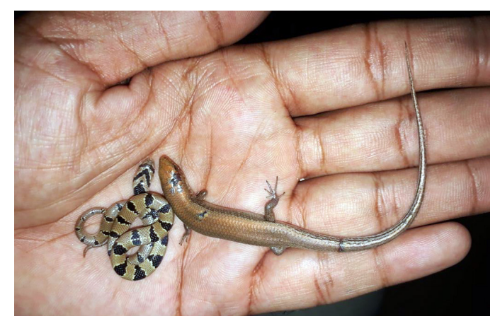
Fig. 15. A Common Kukri Snake ( Oligodon arnensis ) and a Bronze Skink ( Eutropis macularia ) that had been bitten by a dog; both were found during the same night-time survey.

Common Kukri Snakes are primarily nocturnal and crepuscular. They often are encountered near human habita-