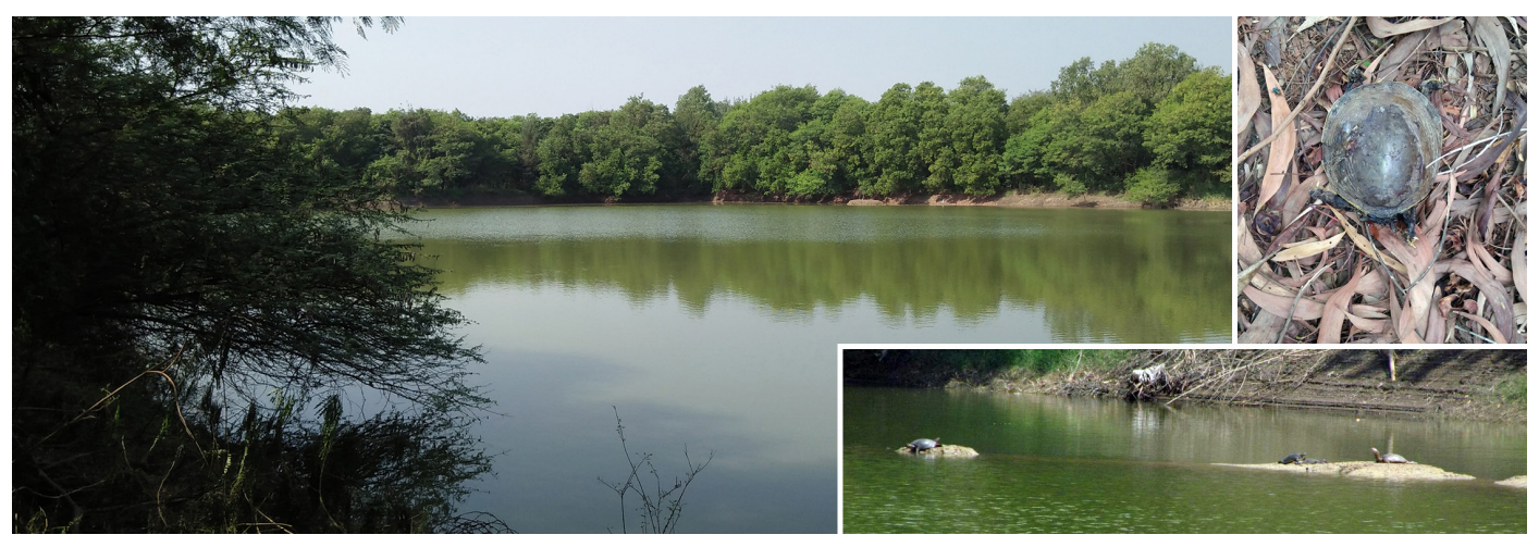
Fig. 1. Nakshetra van is a planted area with many trees and a lake where Common Flap-shelled Turtles ( Lisseymys punctata ) were found (left). A dead turtle found in Nakshetra van (upper right) and turtles basking on mud flats (lower right).

Northern House Gecko, Hemidactylus flaviviridis (Fig. 3): We recorded one individual at 2100 h on 13 June 2018