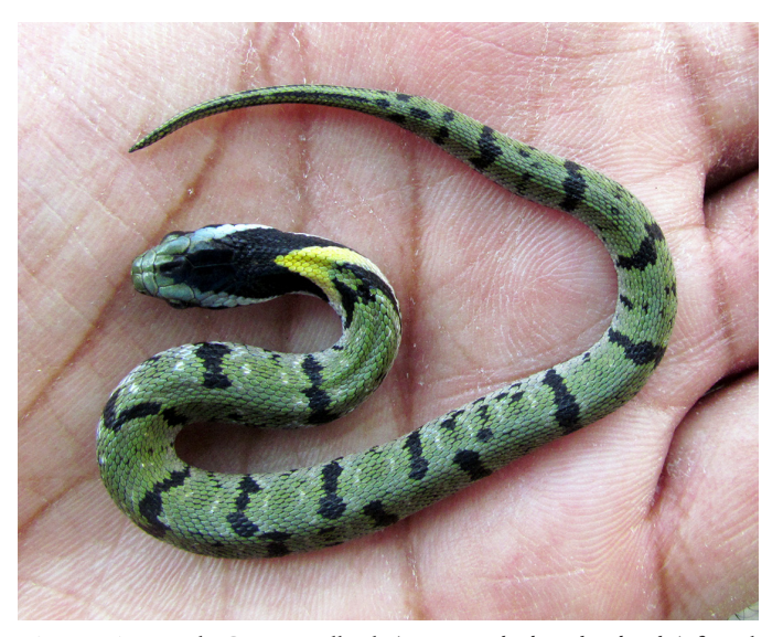
Fig. 19. A juvenile Green Keelback ( Macropisthodon plumbicolor ) found during a field survey at night.