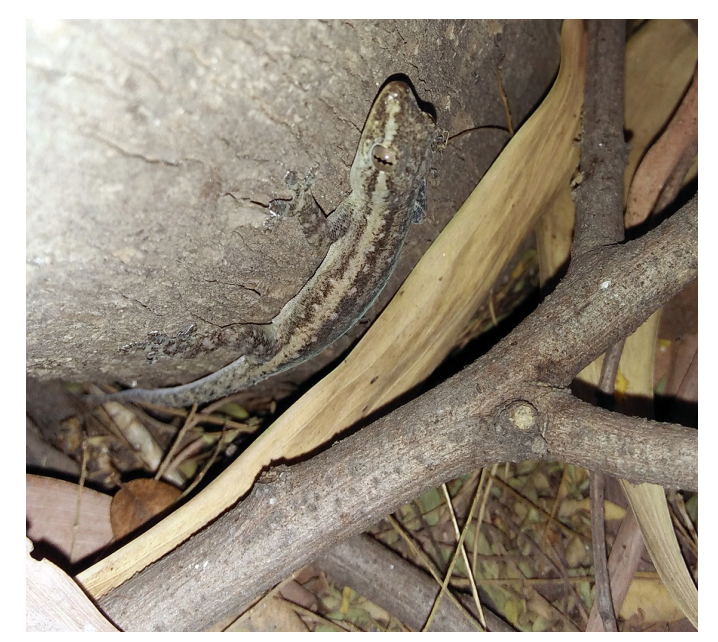
Fig. 4. An adult Southern House Gecko ( Hemidactylus frenatus ) from the Nakshetra van.

Southern House Gecko, Hemidactylus frenatus (Fig. 4): We recorded one individual at 1239 h on 18 April 2018, two juveniles at 1310 h on 26 April 2018, and three more on 9 December 2018, all in Nakshetra van. One of the latter (an