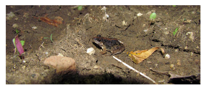
Fig. 28. Indian Cricket Frogs ( Fejervarya limnocharis ) are abundant on the VNSGU campus.

Indian Cricket Frog, Fejervarya limnocharis (Fig. 28): These frogs are abundant on the VNSGU campus, especially around the lake and garden opposite the Fine Arts Department.