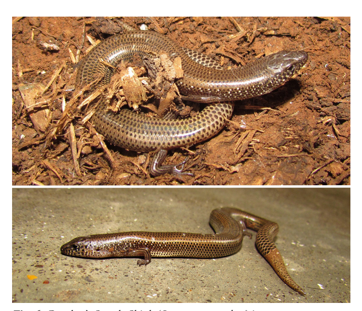
Fig. 6. Gunther's Supple Skink ( Lygosoma guentheri ) is an uncommon species at VNSGU.