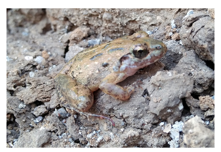
Fig. 27. A Long-legged Cricket Frog ( Minervarya syhadrensis ) found during the day.

Adults are 31–35 mm in length (Daniels 2005). Until recently, this species was assigned to the genus Fejervarya . These frogs are very similar to Fejervarya limnocharis but can be easily distinguished by the bleating sheep-like call and white upper lip with black crossbars (Daniels 2005).