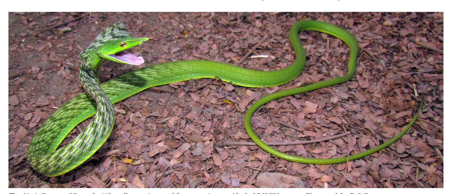
Fig. 31. A Common Vinesnake (Ahaetulla nasuta) rescued from a tree just outside the VNSGU campus.

We also recorded direct and indirect threats affecting the reptiles and amphibians of VNSGU. Road mortality is an increasing threat to biodiversity worldwide. For reptiles and amphibians, roadkills are especially common during the monsoon season (Fig. 32), which generally coincides with the breeding seasons of many species. In addition, snakes are frequently killed by lawn mowers, ongoing new construction destroys microhabitats, and the open burning of wastes (including plastics) renders affected areas uninhabitable by herpetofauna. Nevertheless, VNSGU's heritage of biodiversity can be protected by continuing to raise awareness of land use practices, conserving for example, spaces that may seem available for construction but actually provide habitat for wildlife and plants. One positive development at VNSGU is that killing snakes is rare. Most people prefer to call the snake rescue. An Eco-club in the Department of Biosciences also supports a Snake Awareness Program (SAP), anti-plastic campaigns, tree planting, active encouragement of safe driving to avoid roadkills, efforts to