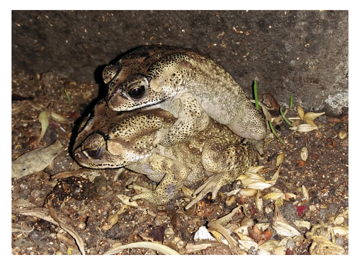
Fig. 24. Common Asian Toads ( Duttaphrynus melanostictus ) in amplexus.

Common Asian Toads grow to 200 mm in length. They breed during monsoons and the larvae are found in still and slow-moving water (van Dijk et al. 2004).