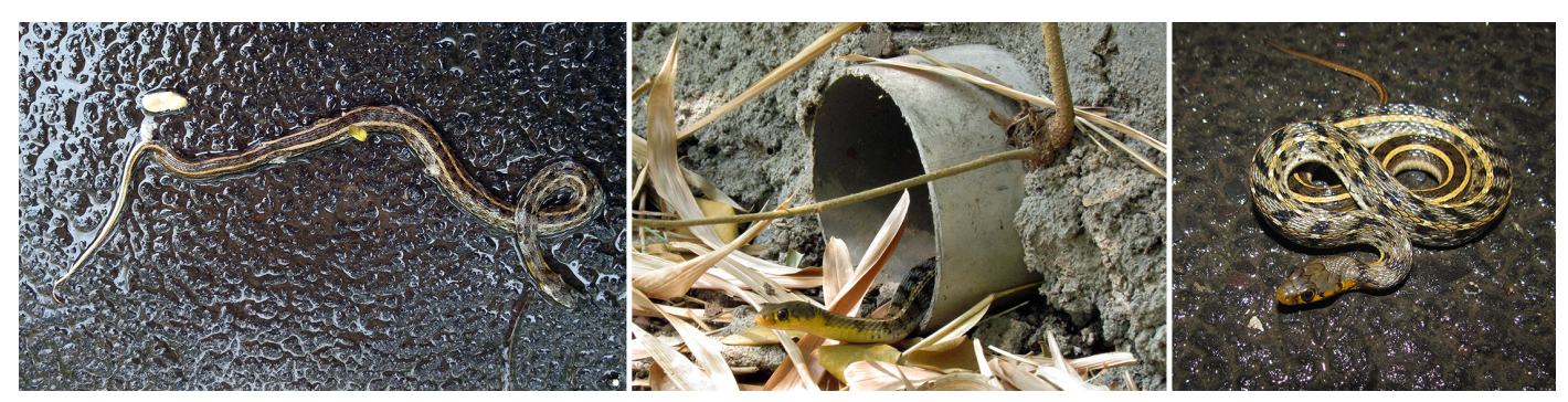
Fig. 18. A gravid female Buff-striped Keelback (Amphiesma stolatum) dead on the road with a fully developed egg (left), a visual encounter of a snake in natural habitat (center), and an individual on a wet road at night indicates that this species is not strictly diurnal (right).