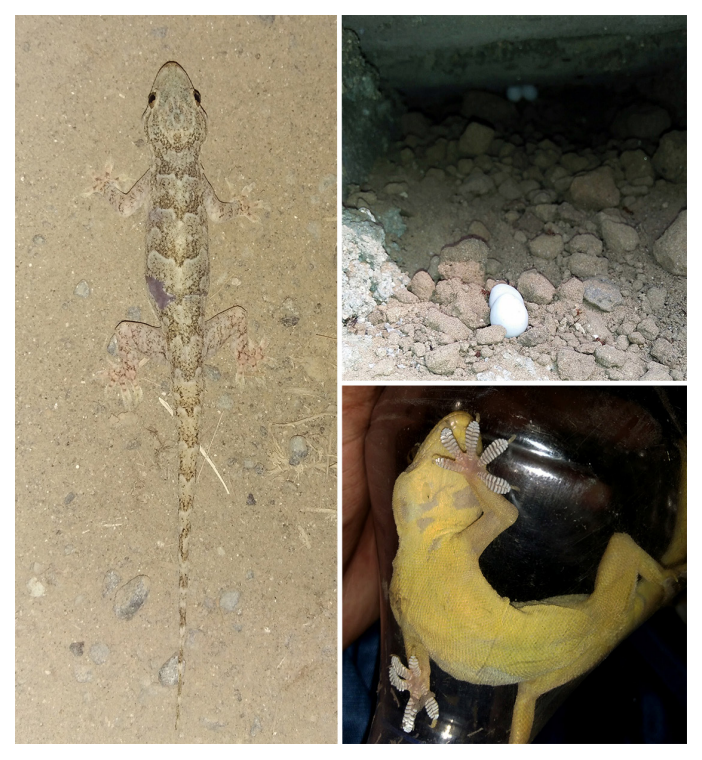
Fig. 3. A Northern House Gecko ( Hemidactylus flaviviridis ) with a bite mark on its trunk, which might have occurred during mating (left); two pairs of eggs in a cavity in a concrete block at the Rural Studies Department (upper right); and the bright yellow venter of a captured gecko (lower right).

on the wall of the Girnar Dormitory and another on a roadside near the Girnar Dormitory on 21 September at 2434 h. The latter had a bite mark on the left side of its trunk, which might have occurred during mating (e.g., Chatterjee et al. 2011). Although not evident in the photograph, we noted chromogenicity or development of a color patch, which occurs in the precoital, coital, and postcoital stages of mating and fades after 2–3 h (Chatterjee et al. 2011). We found three more individuals on a wall of the Rural Studies Department on 9 December 2018 at 1620 h, two more at 1351 h on 11 December 1351 h hiding in the cavities of concrete blocks, and four eggs in another block in the same wall.