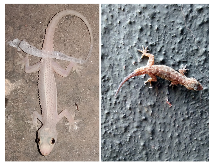
Fig. 2. A Brook's House Gecko ( Hemidactylus brookii ) with shed skin on the tip of its tail (left) and another individual with a distinct, albeit light dorsal pattern (right).

Brook's House Gecko, Hemidactylus brookii (Fig. 2): One gecko with a shed tail was recorded at VNSGU on 24 June 2018 at 2040 h. It was on the wall of the Girnar Dormitory. Another was in ecdysis, with the shed skin hanging on its tail. Two others were at the Bapalal Department's greenhouse (Department of Botany) on 8 December 2018, one inside at 1210 h and another outside at 1235 h. We observed three geckos on 11 December, one at 1130 h near the Sahyadri Dormitory on the dome-like wall of an enclosed drainage system and two outside a netted greenhouse at the Rural Studies Department at 1229 h and 1243 h hiding beneath a thin aluminum sheet. Four found on 14 December 2018 at 1336 h