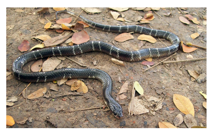
Fig. 20. Common Kraits ( Bungarus caeruleus ) feed mainly on other snakes.

document snakes taken from the Narmada Dormitory, professor's quarters, and the Biotech Department. At 2130 h on 5 April 2011, we found a dead male in the parking area by the gate near the Narmada Dormitory. A juvenile was rescued from a professor's quarters at 2300 h in August 2012 during heavy rainfall. Another rescue involved an adult from a bathroom on the first floor of the Biotech Department at 1045 h in October 2012.