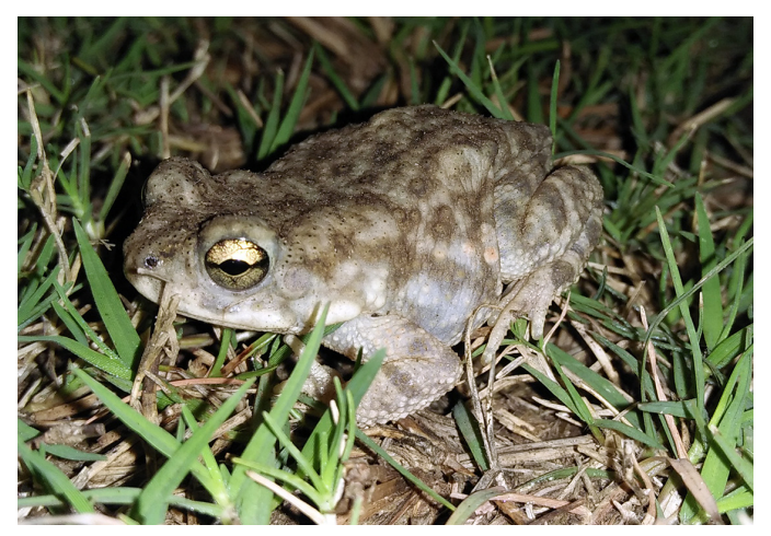
Fig. 26. This Indian Marbled Toad ( Duttaphrynus stomaticus ) is the first record from the Surat District.

These toads are common in floodplains but reach elevations to about 2,000 m. They are tolerant of varying climatic conditions, including those of dry semideserts. Indian Marbled Toads are essentially nocturnal but are mostly diurnal during the breeding season when they congregate and lay eggs mostly in temporary bodies of water (Khan 2002).