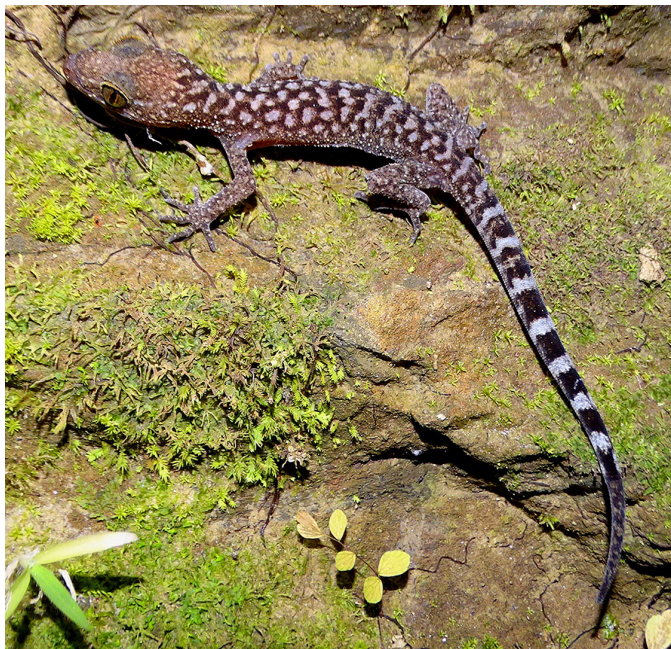
Fig. 1. A female Jampui Bent-toed Gecko ( Cyrtodactylus montanus ) from Pathlawi Lunglen Tlang, Dampa Tiger Reserve, Mizoram, India.

cies, eight have been described since 2018. Previously, the only species of Cyrtodactylus recognized from northeastern