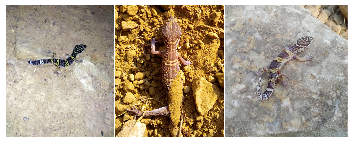
Fig. 3. Photographic vouchers of the Common Leopard Gecko ( Eublepharis macularius ) in Nepal from Gurvakot, Surkhet (left) and from Sunwal, Parasi (center and right).

excavated from under rocks in a dry river bed during gravel extraction near the village of Tilkana in Sunwal, Nawalparasi District, State No. 5, and from Rup Saud (pers. comm.), who found another gecko at 1700 h on 10 June 2018 on school grounds in Gurvakot, Surkhet District, Karnali State. These localities are ca. 180 and 80 km (aerial distance) from the Kamdi Biological Corridor, respectively (Fig. 4).