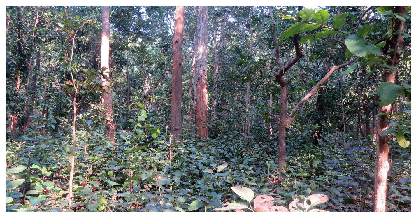
Fig. 2. Habitat of the Common Leopard Gecko ( Eublepharis macularius ) in the Kamdi Biological Corridor, Banke District, Nepal. Photograph by Kul Bahadur Thapa.

We subsequently received photographic evidence of this species (Fig. 3) from Amar Darai (pers. comm.), who photographed two geckos on 18 April 2017 that were injured when