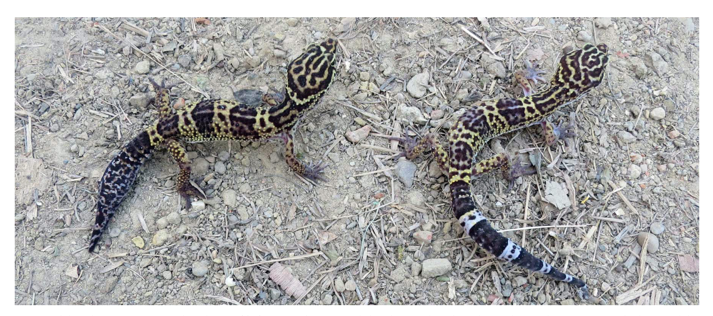
Fig. 1. Adult male Common Leopard Geckos ( Eublepharis macularius ) recorded in the Kamdi Biological Corridor, Banke District, Nepal.

The habitat (Fig. 2) appears to be more mesic and densely vegetated than that at other localities where this species is known to occur. However, the mixed hardwood forests in the lower Sivalik Hills within the corridor are drained only by intermittent streams and represent the driest mountain ecosystem in Nepal. Nocturnal December temperatures in the