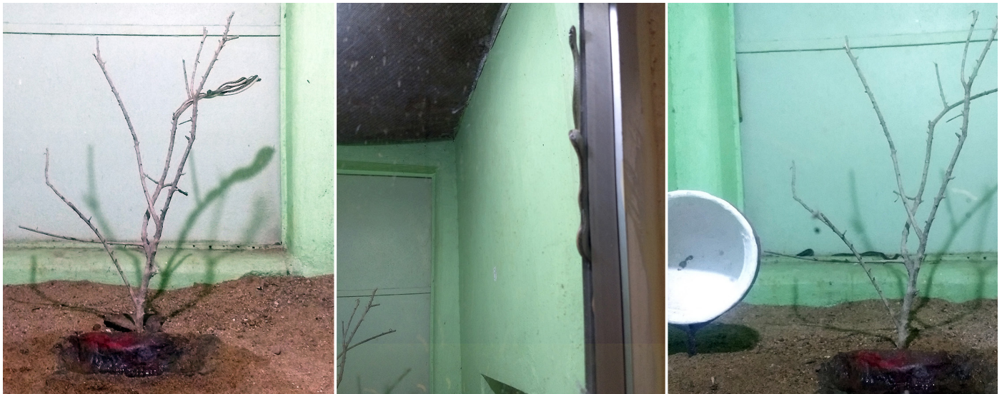
Fig. 3. Captive Striped Keelbacks ( Amphiesma stolatum ) snake on a branch (left), on the glass (center), and on the wall (right) in the Chennai Snake Park, Guindy, Chennai, Tamil Nadu, India.

and sometimes rodents and birds (Daniel 2002; Das 2002; Whitaker and Captain 2004). Olive Keelbacks ( Atretium schistosum ; Fig. 2) have an average total length of ~870 cm, are active by day, usually are found in water or nearby vegetation, and feed on frogs, fish, and crabs (Daniel 2002; Das 2002; Whitaker and Captain 2004). Striped Keelbacks ( Amphiesma stolatum ; Fig. 3) have an average total length of ~80 cm and are diurnal but sometimes extend activity into the evening when hunting prey; they occur in grasslands, rice fields, marshy areas, and lowland forests, often along the banks of rivers (Daniel 2002; Das 2002; Whitaker and Captain 2004).