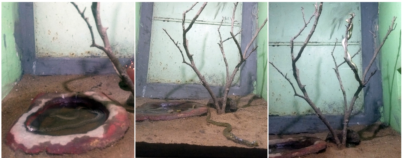
Fig. 1. Captive Checkered Keelbacks ( Fowlea piscator ) in water (left, center), on sand (center), and on a branch (right) in the Chennai Snake Park, Guindy, Chennai, Tamil Nadu, India.

Focal species. —Checkered Keelbacks ( Fowlea piscator ; Fig. 1), average total length ~1.75 m, are one of the most abundant species of snakes in India. They are active by day and night; live in the vicinity of freshwater; and young feed on frog eggs, tadpoles, and aquatic insects, whereas adults feed on fish, frogs,