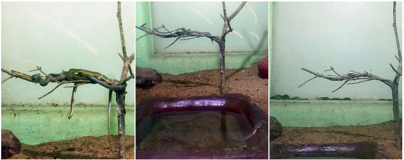
Fig. 2. Captive Olive Keelbacks ( Atretium schistosum ) on a branch (left, center, right), in water (center), and on the wall (right) in the Chennai Snake Park, Guindy, Chennai, Tamil Nadu, India.