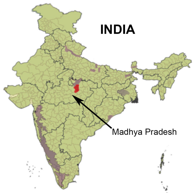
Fig. 2. Map of India showing the distribution of Forsten's Catsnake ( Boiga forstenii ; gray shading) and the range extension in the Damoh District, Madhya Pradesh (red).