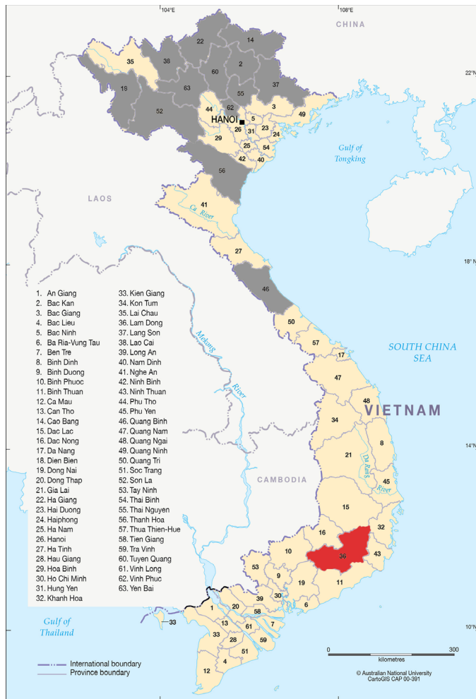
Fig. 3. Map of Vietnam ( http://asiapacific.anu.edu.au/maponline/base-maps/vietnam-provinces ) showing the previously known distribution of the Black-banded Trinket Snake ( Oreocryptophis porphyraceus ) in gray and the range extension in Lam Dong Province in red.

3; Ziegler et al. 2004). This record extends the distribution to Lam Dong Province and is the first report of the species in southern Vietnam.