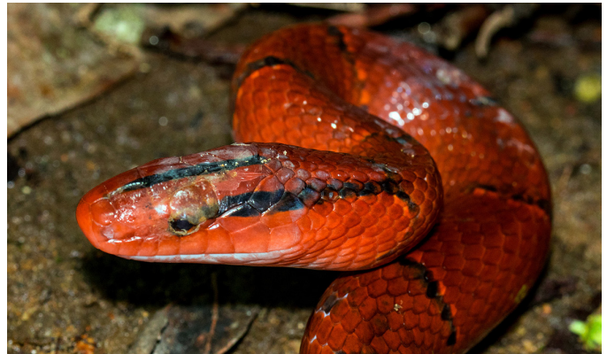
Fig. 2. Visible damage to the left eye of a Black-banded Trinket Snake ( Oreocryptophis porphyraceus ) found on 2 March 2019 in Lam Dong Province, Vietnam.

On 2 March 2019 at 2211h, colleagues and I found a Black-banded Trinket Snake crossing a stream (Fig. 1) in the western highlands of Lam Dong Province (11.4475°N, 108.0648°E; WGS 84; 1,281 m asl). The landscape of this area is dominated by tropical montane evergreen forest. Based on criteria listed by Das (2016), we assigned this snake to the subspecies O. p. vaillanti . Snout-vent length (SVL) was 61.5 cm and total length (TL) 76 cm. Some damage to the left eye was evident (Fig. 2).