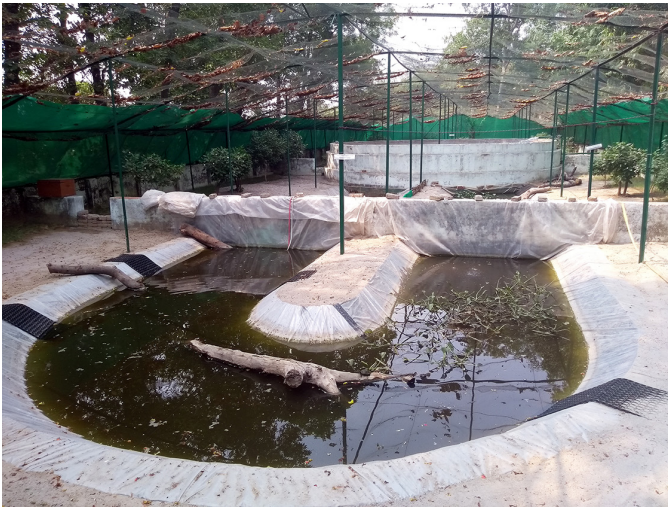
Fig. 10. Improvements to enclosures (here renovated enclosure E-2) provide simulated habitats that increase chances of survival when turtles are released into natural environments.

fit to survive in their natural habitat (Fig. 10), which helps to sustain viable populations in the wild. Because freshwater turtles are important components of aquatic habitats, the Rescue and Rehabilitation Centre at Sarnath plays a vital role in ecological sustainability (Fig. 11).