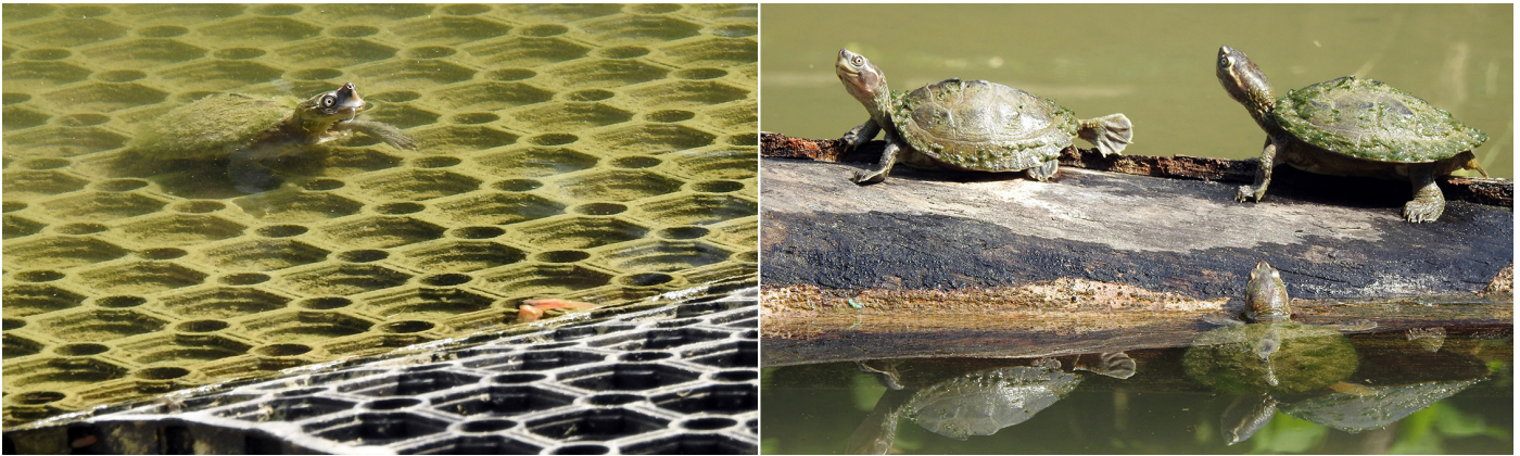
Fig. 7. Critically Endangered Three-striped Roof Turtles ( Batagur dhongoka ) using the haul-out mats (left) and logs for basking (right).