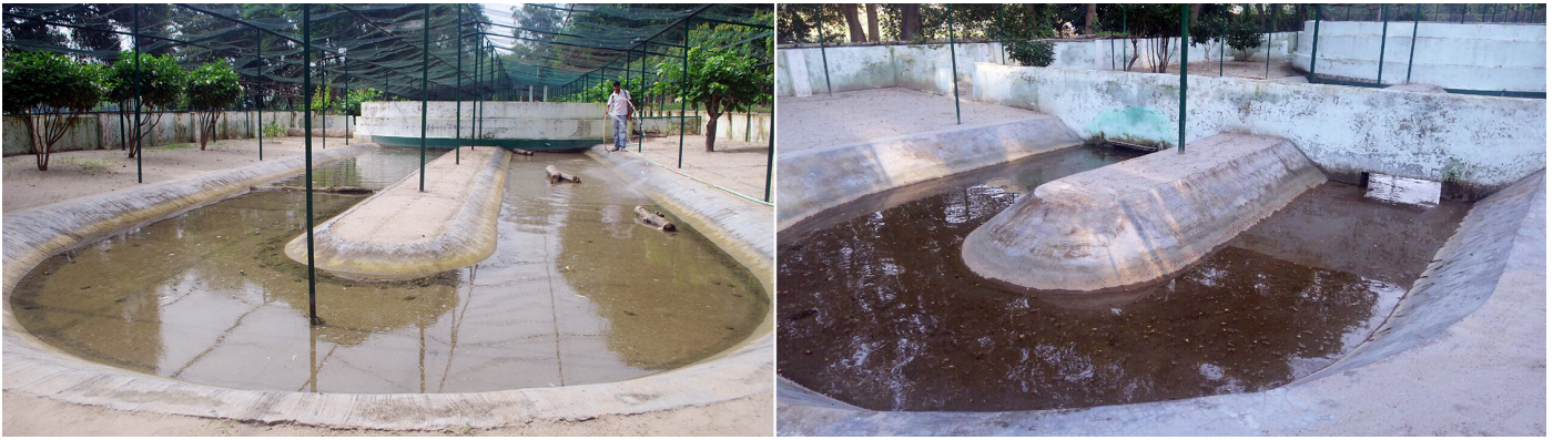
Fig. 2. Functional enclosures E-1 (left) and E-2 (right) at the onset of the project.