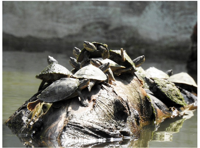
Fig. 11. Critically Endangered Three-striped Roof Turtles ( Batagur dhongoka ) slated for release at the Turtle Breeding and Rehabilitation Centre, Sarnath, Varanasi, Uttar Pradesh, India.

We thank the National Mission for Clean Ganga for providing funding to execute this work and to the Uttar Pradesh