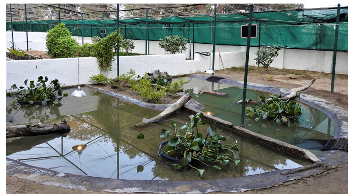
Fig. 6. Landscaping in the renovated enclosure E-1.

have been enriched with species-specific upgrades. In accordance with the ecology of the species, new furnishings and upgraded bio-filtration and aeration systems have been incorporated. Diets have been adjusted to match the feeding habits of each species. The enclosures are covered on all four sides with green shade drapes (Fig. 3) to minimize interaction with humans, whereas the top remains exposed to natural sunlight for basking. Additional enclosures have been added to