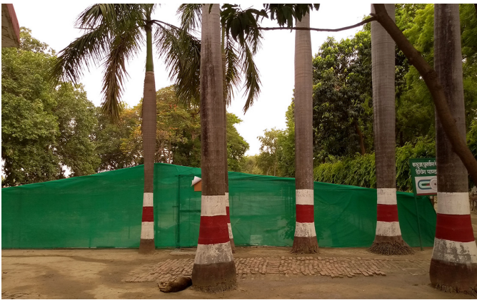
Fig. 3. Enclosures covered with green shade to minimize interaction with humans.