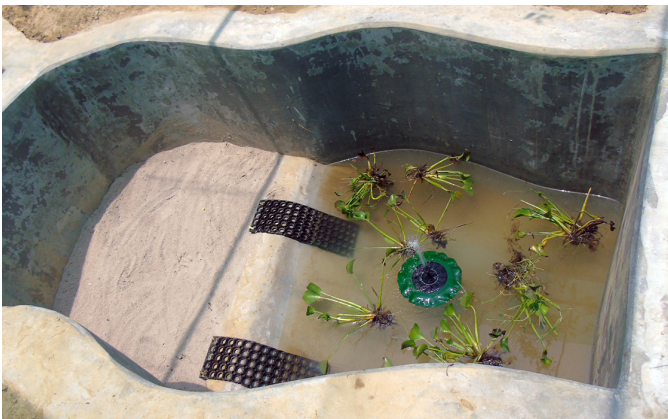
Fig. 4. A new juvenile enclosure to allow close monitoring for one month after hatching.

accommodate age-class requirements. These include a juvenile enclosure (Fig. 4) that holds hatchlings for a month to allow careful monitoring. A part of the previously non-functional E-3 was renovated and extended to accommodate large turtles weighing 20–50 kg (Fig. 5). Landscaping inside the enclosures includes logs for basking, aquatic macrophytes for cover and food, water circulation units, hides, shades, and haul-out mats to improve aesthetics, provide the animals with better opportunities to exhibit natural behaviors, and reduce the stress of captivity (Figs. 6 & 7). Live fishes have also been incorporated for the carnivorous and omnivorous species for