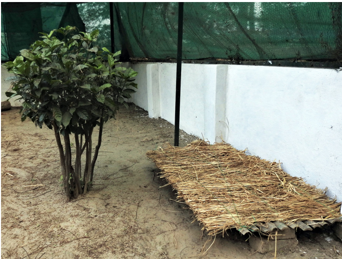
Fig. 9. Thatched shades and small trees in the enclosures provide shelter during the heat of summer.

the same purpose. For sanitation and hygiene of the enclosure, 20% of the total water volume is changed every three days, ponds are scrubbed clean once a month, and the premises are cleaned regularly.