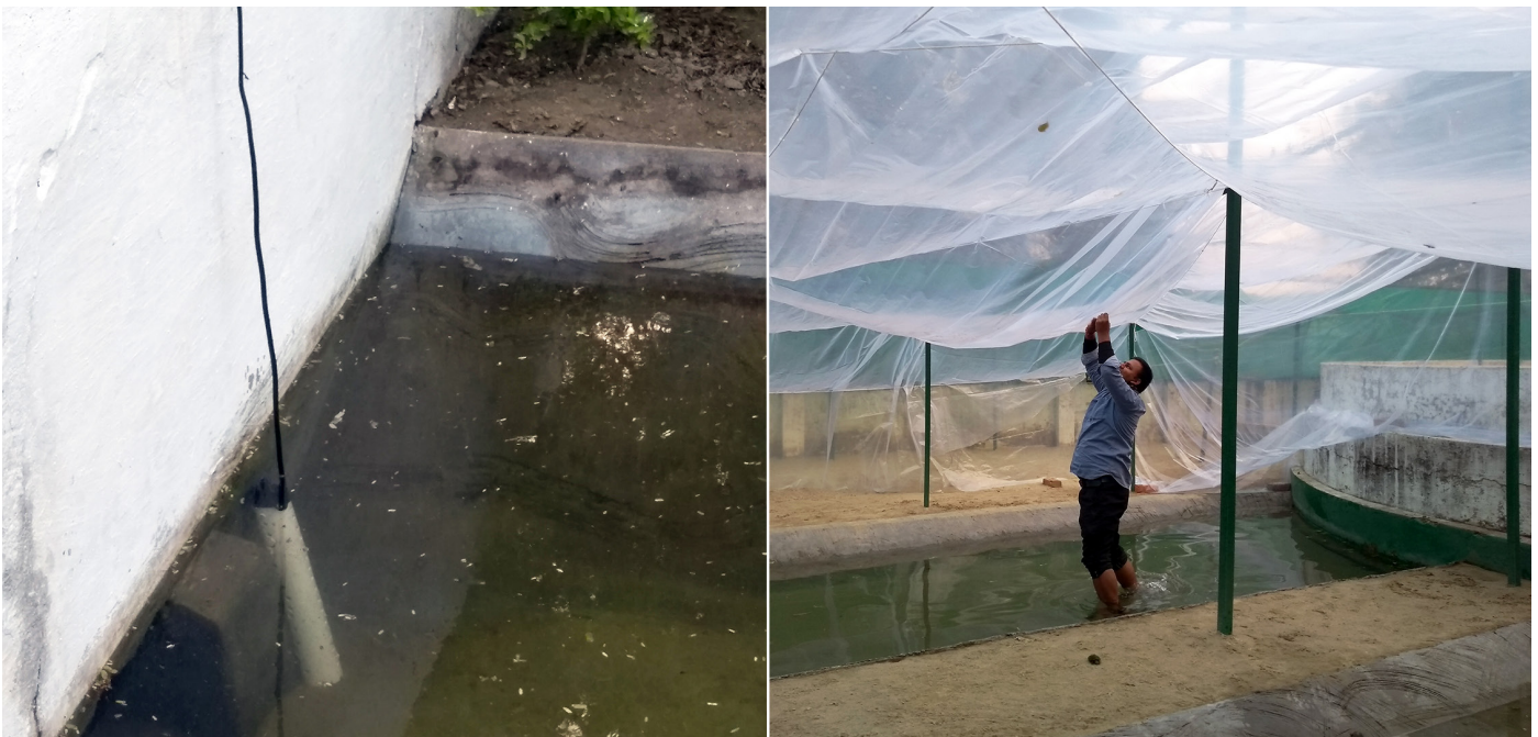
Fig. 8. During the winter, water heaters (left) are installed for temperature management and plastic sheeting (right) provides insulation.