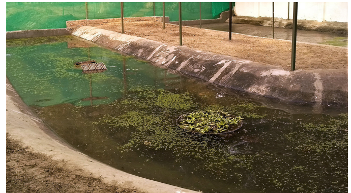
Fig. 5. Part of the previously non-functional enclosure E-3 after renovation. This enclosure houses large turtles weighing 20–50 kg.

accommodate age-class requirements. These include a juvenile enclosure (Fig. 4) that holds hatchlings for a month to allow careful monitoring. A part of the previously non-functional E-3 was renovated and extended to accommodate large turtles weighing 20–50 kg (Fig. 5). Landscaping inside the enclosures includes logs for basking, aquatic macrophytes for cover and food, water circulation units, hides, shades, and haul-out mats to improve aesthetics, provide the animals with better opportunities to exhibit natural behaviors, and reduce the stress of captivity (Figs. 6 & 7). Live fishes have also been incorporated for the carnivorous and omnivorous species for