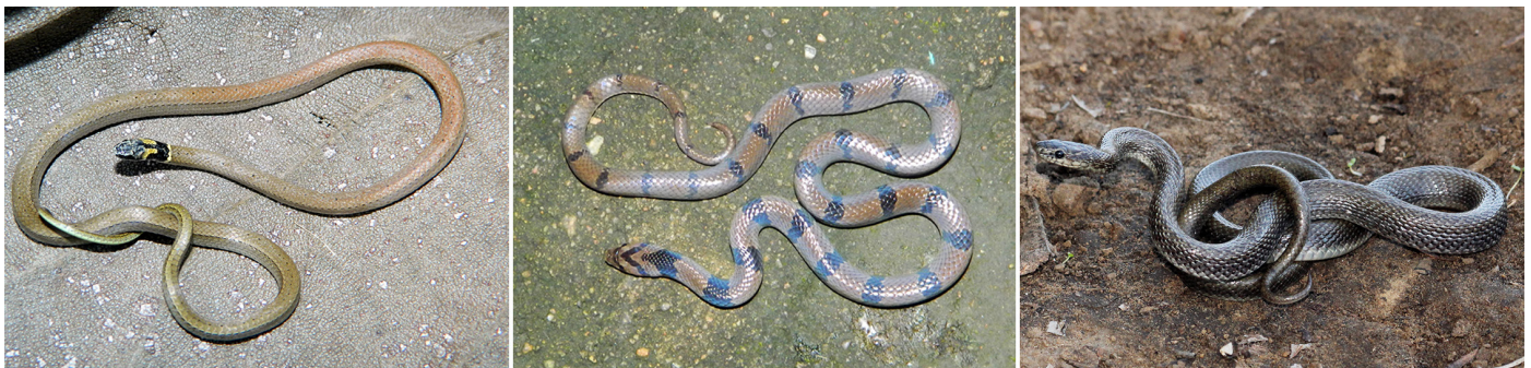
Fig. 4. Duméril's Black-headed Snake ( Sibynophis subpunctatus ) from Tumsar Tehsil (left). Common Kukri Snake ( Oligodon arnensis ) from Nilaj, Sakoli Tehsil (center). Indian Smooth Snake ( Coronella [= Wallophis ] brachyura ) from the outskirts of the Gaidongari Reserve Forest, Pauni Tehsil (right).