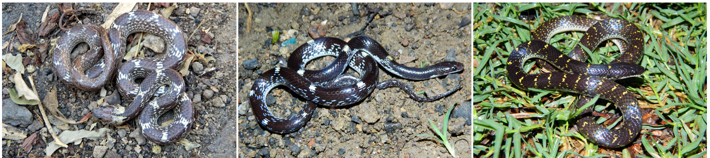
Fig. 5. Common Wolfsnake ( Lycodon aulicus ) from Mohadi Tehsil (left). Barred Wolfsnake ( Lycodon striatus ) from Jawahar Nagar, Bhandara City (center). Yellow-spotted Wolfsnake ( Lycodon flavomaculatus ) from the outskirts of Chinchgaon Village Lakhandur Tehsil (right).