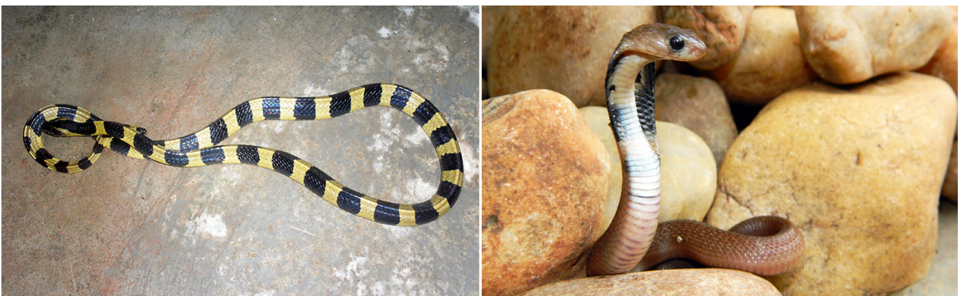
Fig. 12. Banded Krait ( Bungarus fasciatus ) from Pauni Tehsil (left). Indian Cobra ( Naja naja ) from Pauni Tehsil (right).