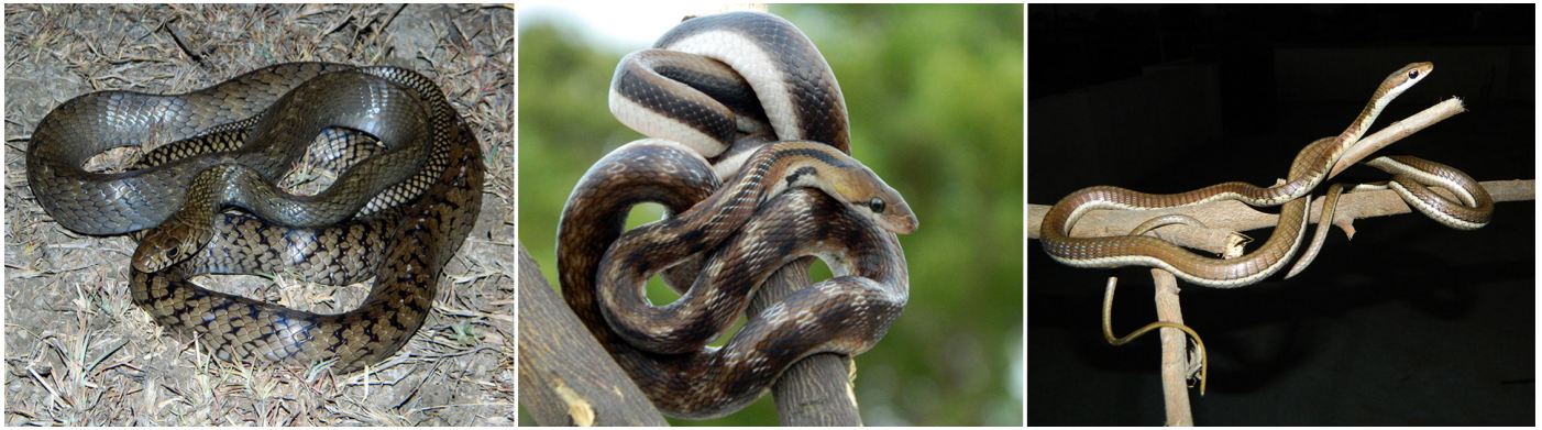
Fig. 6. Oriental Ratsnake ( Ptyas mucosa ) from Tumsar Tehsil (left). Common Trinket Snake ( Coelognathus helena ) from Sakoli Tehsil (center). Common Bronze-backed Treesnake ( Dendrelaphis tristis ) from Pauni Tehsil (right).