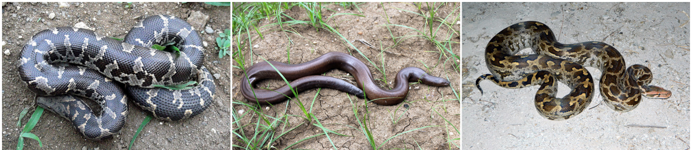
Fig. 3. Common Sand Boa ( Eryx conicus ) from Manegaon Village, Lakhani Tehsil (left). Red Sand Boa ( Eryx johnii ) from the Bhandara–Ramtek Road, Tumsar Tehsil (center). Indian Rock Python ( Python molurus ) from Tamaswadi Village, Tumsar Tehsil (right).

79°51'23.14"E) at Manegaon in Lakhani Tehsil on 21 July 2014; (8) two adult Green Keelbacks ( Rhabdophis plumbicolor ) attempting to swallow one another near Belgota Village in Pauni Tehsil (20°46'39.95"N, 79°38'21.38"E) on 5 October 2013; (9) a live Olive Keelback ( Atractium schistosum ) trapped in a fishing net in a pond at Sawargaon in Lakhandur Tehsil (20°43'35.72"N, 79°52'20.99"E) on 28 February 2015; (10) a Saw-scaled Viper ( Echis carinatus ) feeding on a frog on 13 September 2014 in Teak leaf litter in the Davezari Village area in Tumsar Tehsil (21°27'02.51"N, 79°47'19.20"E); (11) a Slender Coralsnake ( Calliophis malanurus ) regurgitating a Brahminy Blindsnake ( Indotyphlops braminus ) in an open sewage line on 21 April 2013 at Paraswada Village in Mohadi Tehsil (21°20'26.39"N, 79°43'32.07"E); (12) a Common Indian Krait ( Bungarus caeruleus ) feeding on a Common