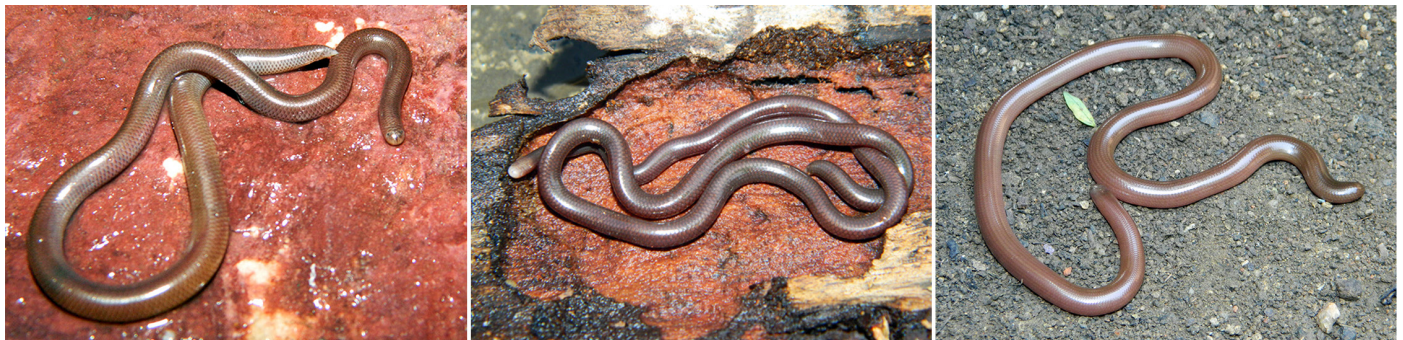
Fig. 2. Brahminy Blindsnake ( Indotyphlops braminus ) from Mahalgaon Village, Mohadi Tehsil (left). Slender Wormsnake ( Indotyphlops porrectus ) from Lakhandur Tehsil (center). Beaked Wormsnake ( Grypotyphlops acutus ) from Hardoli, Mohadi Tehsil (right).