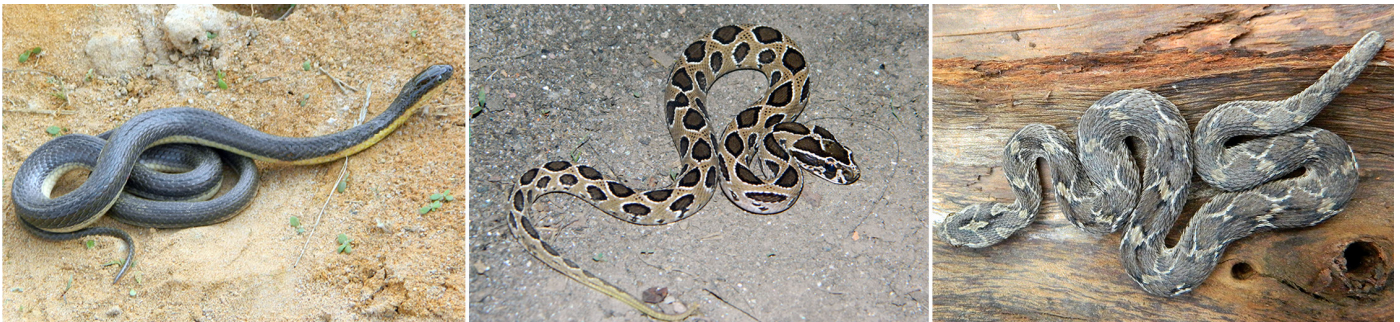
Fig. 10. Olive Keelback ( Atretium schistosum ) from the Bhandara Road in Pauni Tehsil (left). Russell's Viper ( Daboia russelii ) from Sakoli Tehsil (center). Saw-scaled Viper ( Echis carinatus ) from Tumsar Tehsil (right).