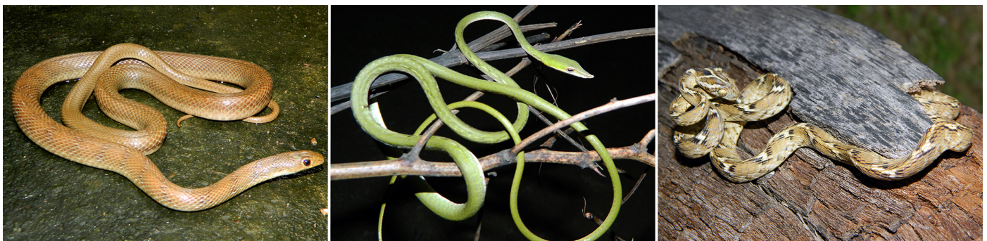
Fig. 7. Banded Racer ( Argyrogena fasciolata ) from Ganeshpur Khairy, Tumsar Tehsil (left). Long-nosed Whipsnake ( Ahaetulla nasuta ) from Pauni Tehsil (center). Common Catsnake ( Boiga trigonata ) from Chinchkhed, Mohadi Tehsil (right).