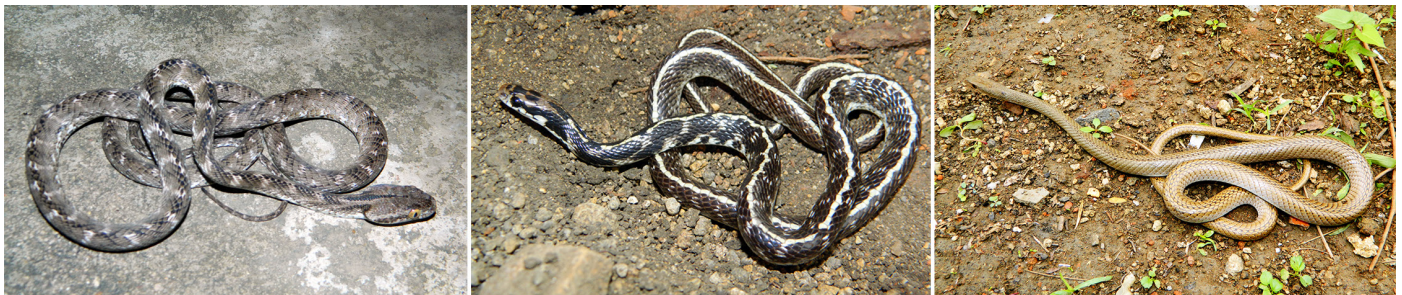
Fig. 8. Forsten's Catsnake ( Boiga forsteni ) from the temple in Adyal, Pauni Tehsil (left). Indian Egg-eater ( Elachistodon [= Boiga ] westermanni ) from Pauni Tehsil (center). Stout Sandsnake ( Psammophis longifrons ) from Pauni Tehsil (right).

Wolfsnake ( Lycodon aulicus ) during a rescue operation in the Hanuman Temple near Khairlanji Village (21°22'05.13"N, 79°34'26.60"E) on 19 November 2015; (13) an adult male Indian Cobra ( Naja naja ) regurgitating a Common Sand Boa ( Eryx conicus ) in an agricultural field near Lakhani (21°04'1.03"N, 79°49'37.42"E).