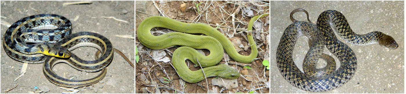
Fig. 9. Striped Keelback ( Amphiesma stolatum ) from Lakhandur Tehsil (left). Green Keelback ( Macropisthodon [= Rhabdophis ] plumbicolor ) from Lakhani Tehsil (center). Checkered Keelback ( Fowlea [= Xenochrophis ] piscator ) from Mohadi Tehsil (right).