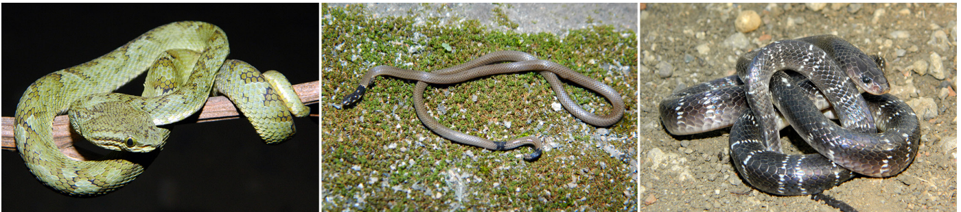
Fig. 11. Bamboo Pitviper ( Trimeresurus gramineus ) from Pauni Tehsil (left). Slender Coralsnake ( Calliophis melanurus ) from Mohadi Tehsil (center). Common Indian Krait ( Bungarus caeruleus ) from Lakhandur Tehsil (right).