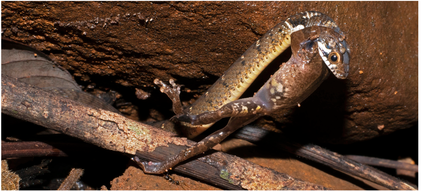
Fig. 2. A Nilgiri Keelback ( Hebius beddomei ) from Adarwadi Devrai, Tamhini Ghat, Pune, Maharashtra, India, ingesting a Ghat's Shrub Frog ( Raorchestes ghatei ).