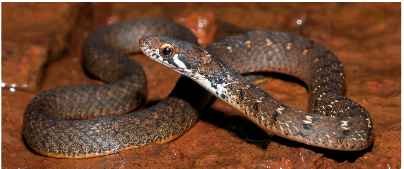
Fig. 1. A Nilgiri Keelback ( Hebius beddomei) from Adarwadi Devrai, Tamhini Ghat, Pune, Maharashtra, India.