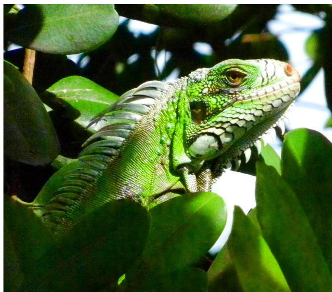
Fig. 1. A Green Iguana ( Iguana iguana ) from Arima, Trinidad and Tobago.

In order to determine in which towns and urban regions across Trinidad Green Iguanas are most frequently observed, my aim was to collect records of Green Iguana sightings using citizen-science tools readily and freely available and map their distribution. I also wanted to illustrate how an inexpensive approach in a limited time can be used to monitor the distribution of an exploited reptile and help determine which urban areas are potentially important for Green Iguanas based on numbers of individuals reported. This information can be used to determine whether these areas also require stricter forms of protection in order to better manage and conserve local Green Iguana populations for future generations.