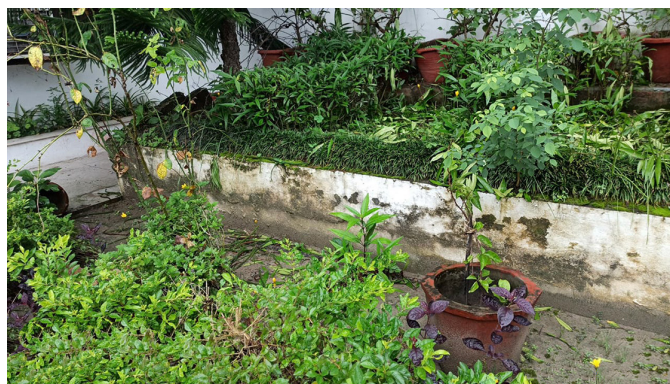
Fig. 1. Collection site of a juvenile Arrowback Tree Snake ( Boiga gocoool ) at Palia Kalan, Lakhimpur Kheri District, Uttar Pradesh, India.

At 1107 h on 14 July 2020, Mr Amitosh Jaiswal captured a snake after one of his gardeners was bitten on the hand while watering a flower pot in the Tiger Rhino Resort (Fig. 1) at Palia Kalan adjacent to the Chaman Chouraha Road near Dudhwa