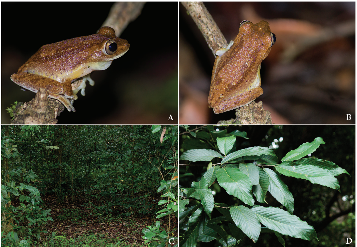
Fig. 2. The Myristica Swamp Treefrog ( Mercurana myristicapalustris ) in natural habitat: Male vocalizing from a branch perch (A & B), forest floor in the swamp in the early monsoon season (C), Gowrimara ( Polyalthia fragrans ), the predominant plant species in the swamp (D).

and 0.5 \mu l dNTPs (2 mM), 0.25 \mu l of each primer (10 \mu M), 1 \mu l of Taq DNA polymerase (Phire Hot start DNA polymerase), 14 \mu l of dH 2 O and 4 \mu l of template DNA (10–20 ng). The following thermocycling conditions were used for amplifications: 95 °C for 5 min, followed by 32 cycles of 95 °C for 30 sec, 58 °C for 40 sec, 72 °C for 90 sec, followed by a final extension step at 72 °C for 5 min. The PCR products were visualized on 1% agarose gels and purified using Exo Sap IT (USB). Sequencing was performed using the PCR primers and products were labeled with BigDye Terminator V.3.1 Cycle Sequencing Kit (Applied Biosystems, Inc) and sequenced in an ABI 3730 capillary sequencer following manufacturer's instructions. The new sequence is deposited in GenBank under accession number MT913017.