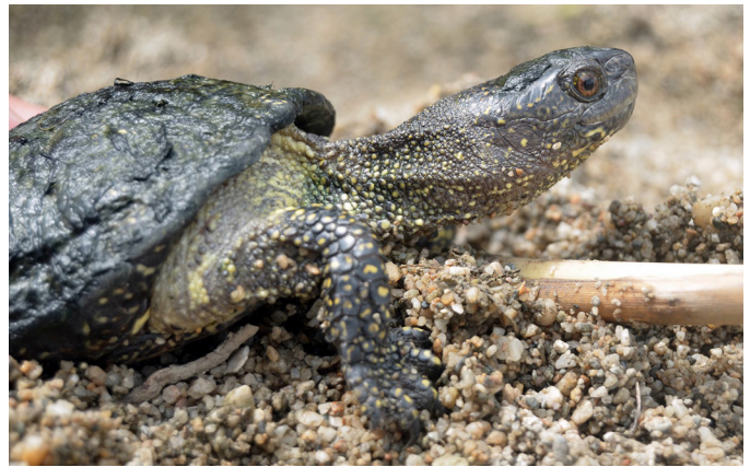
Fig. 1. A young European Pond Turtle ( Emys orbicularis ).

The European Pond Turtle ( Emys orbicularis ) (Fig. 1) is widely distributed from northwestern Africa (where it occupies the Mediterranean region that includes island populations) to Lithuania in the north and Iran in the east. In Spain, it has a fragmented distribution. These turtles are increasingly stressed by habitat alterations, industrial and agricultural pollution, marsh drainage, aquifer water extraction, fisheries bycatch, and to a lesser degree by collecting for consumption or pets (Rodríguez-Rodríguez and Escrivà-Colomar 2016). The species is listed as near-threatened (NT) on the IUCN Red List