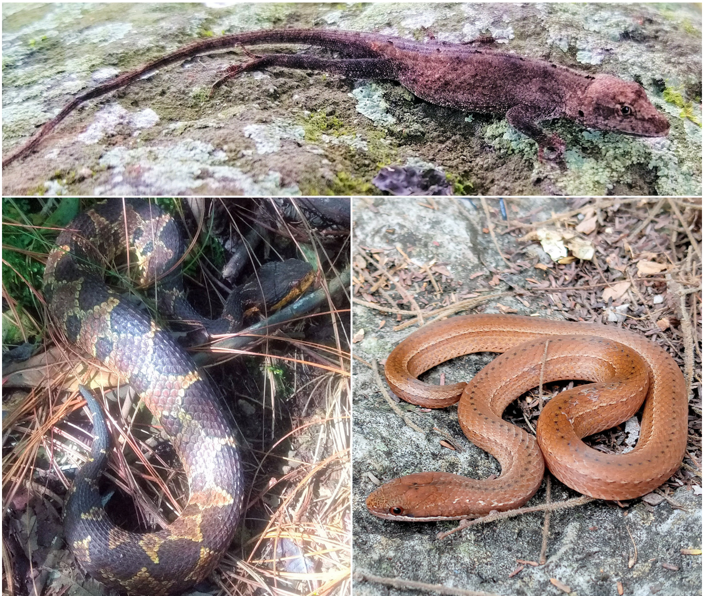
Fig. 4. Species recorded for the first time in the Municipality of Rafael Delgado, Veracruz, Mexico (reptiles): (G) White Anole ( Anolis laeiventris ), (H) Jumping Pitviper ( Metlapilcoatlus nummifer ), and (I) Yellow-bellied Snake ( Coniophanes fissidens ).

forest. For P. granitum , we add a new locality to the three recorded in the recent description of the species (García-Bañuelos et al. 2020). For P. werleri , our new record represents a considerable extension of the previously known distribution and the high genetic divergence found is suggestive of a structured population. Future studies and fieldwork are needed to find more of these salamanders in areas between sites that could provide valuable information regarding its conservation status.