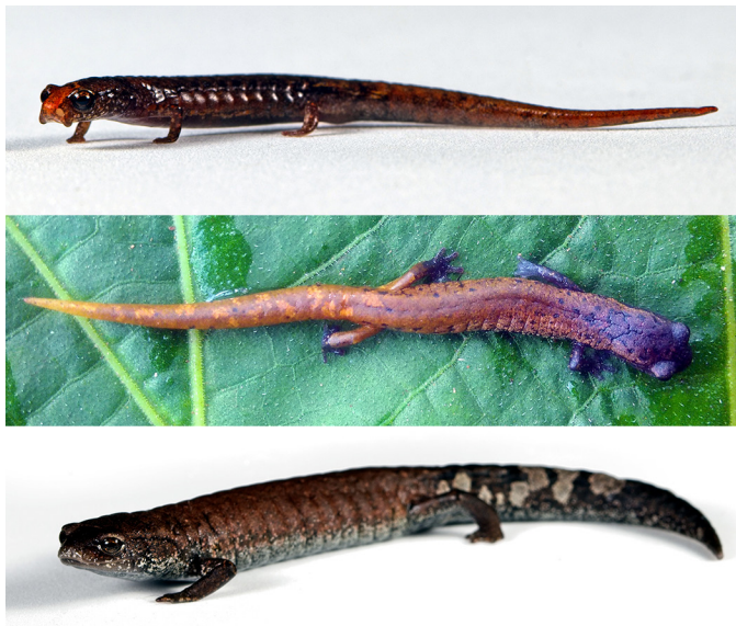
Fig. 2. Species recorded for the first time in the Municipality of Rafael Delgado, Veracruz, Mexico (salamanders): (A) Townsend's Salamander ( Parvimolge townsendi), (B) Granite-colored Salamander ( Pseudoeurycea granitum), and (C) Werler's Salamander ( P. werleri).