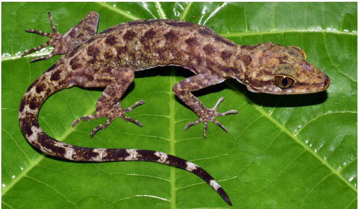
Fig. 1. An adult female Urban Bent-toed Gecko ( Cyrtodactylus urbanus ) from from Nongpoh, Meghalaya, India.

On 14 April 2019, we encountered a female Urban Bent-toed Gecko (SVL 62.4 mm) (Fig. 1) in Nongpoh, Ri-Bhoi District, Meghalaya (25.9081°N, 91.8543°E; Fig. 2). To confirm the identity of the gecko, we generated partial ND2 sequences and used the primers MetF1 and H5934 (Macey et al. 1997) for amplification in order to compare all of the species within the C. khasiensis group. Using Mega 7 (Kumar et al. 2016), we calculated the uncorrected p-distance. The