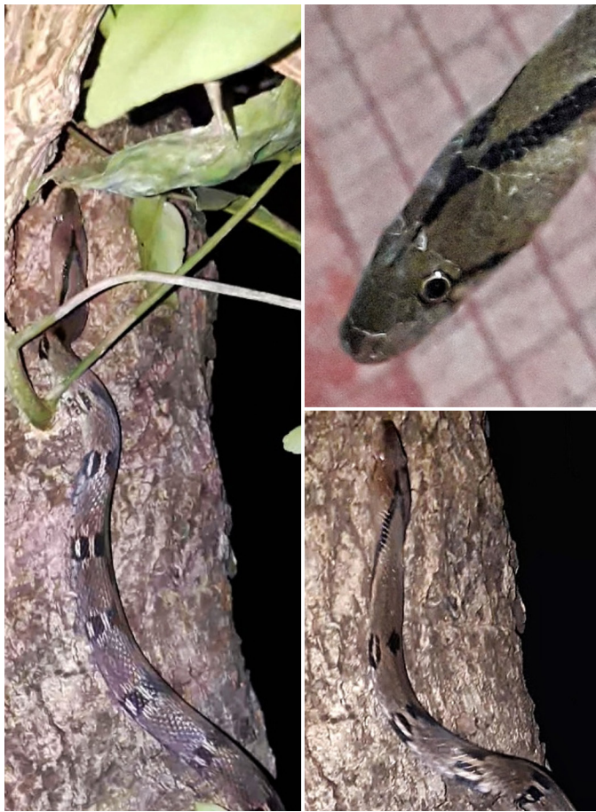
Fig. 1. An Arrow-headed Trinket Snake ( Coelognathus helena nigriangularis ) from Churcha, Koriya, Chhattisgarh, India.

first for the Koriya District is 494 km north of the previous record in southern Chhattisgarh and 166 km from the nearest known locality in Madhya Pradesh (Fig. 2). A photographic voucher has been deposited in the Milwaukee Public Museum (MPM VZP 1007). The identity of the species was confirmed by Pratyush Mohapatra, Zoological Survey of India, CZRC, Jabalpur, Madhya Pradesh, India.