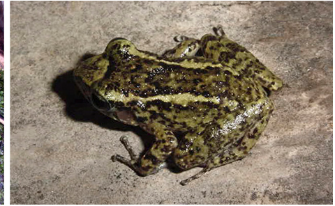
Fig. 1. The Oriente Streamside Frog (Eleutherodactylus cuneatus) is quite variable in color and pattern.