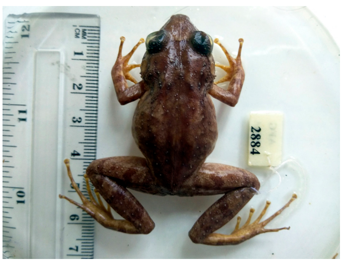
Fig. 3. Adult female Oriente Streamside Frog ( Eleutherodactylus cuneatus , BSC.H-3280) collected 2.1 km WSW of La Caoba, San Luis Municipality, Santiago de Cuba Province, Cuba.