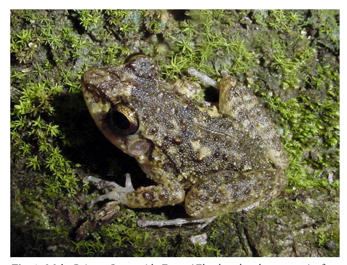
Fig. 2. Male Oriente Streamside Frogs ( Eleutherodactylus cuneatus ) often call from the ground in forested areas near streams.

At about 0915 h on 26 May 2005, we collected an adult female E. cuneatus (49.9 mm SVL with eggs clearly visible through the abdominal skin; Fig. 3) on a stream bank 2.1 km