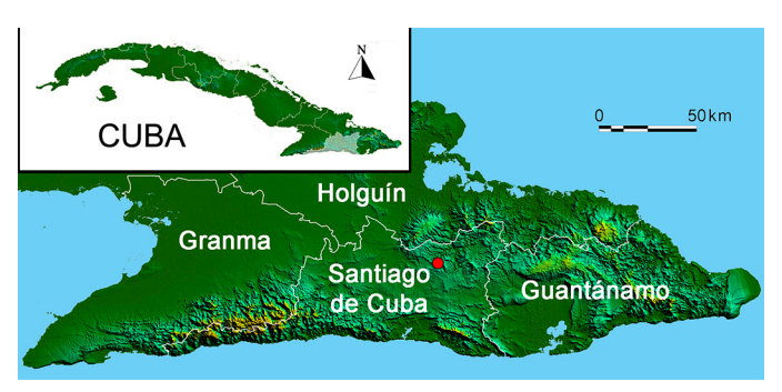
Fig. 4. Map of eastern Cuba depicting the locality (red dot) where we collected the female Oriente Streamside Frog ( Eleutherodactylus cuneatus ) in the foothills of the Sierra de Nipe.

WSW of La Caoba, San Luis Municipality, Santiago de Cuba Province, Cuba (Fig. 4). The vegetation in the area comprised a patchwork of coffee plantations, semideciduous forest, and mixed cultures. Another smaller individual (possibly a male) was close to the female but could not be captured.