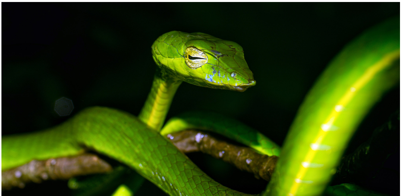
Fig. 1. A Green Vinesnake ( Ahaetulla nasuta ) from the Matheran Hill Station, Maharashtra, India.

The hill station of Matheran is an eco-sensitive zone in the hilly terrain of the narrow northern belt of the Western Ghats. Wall (1909) conducted a survey of the area and provided a checklist of snakes; however, the area covered by his survey has changed due to the gradual (but cumulative)