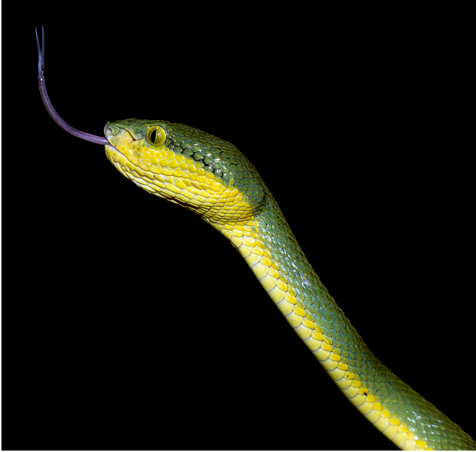
Fig. 2. A Common Bamboo Pitviper ( Trimeresurus gramineus ) from the Matheran Hill Station, Maharashtra, India.