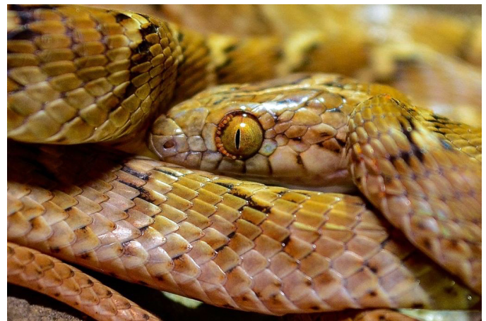
Fig. 7. Mite ( Trombidium sp.) infestation of the left eye of a Common Catsnake ( Boiga trigonata ) from the Matheran Hill Station, Maharashtra, India.

son but also suggested that at least some species in drier areas hibernate during the cool, dry winters. We also noted a slight decrease in snake encounters during the duration of the study (Fig. 6), which we attributed to increasing anthropogenic interference, including habitat loss and fragmentation and increased road mortality. Although tourism provides vital support for the forest reserve, it appears to have adverse effects on snake numbers and diversity.