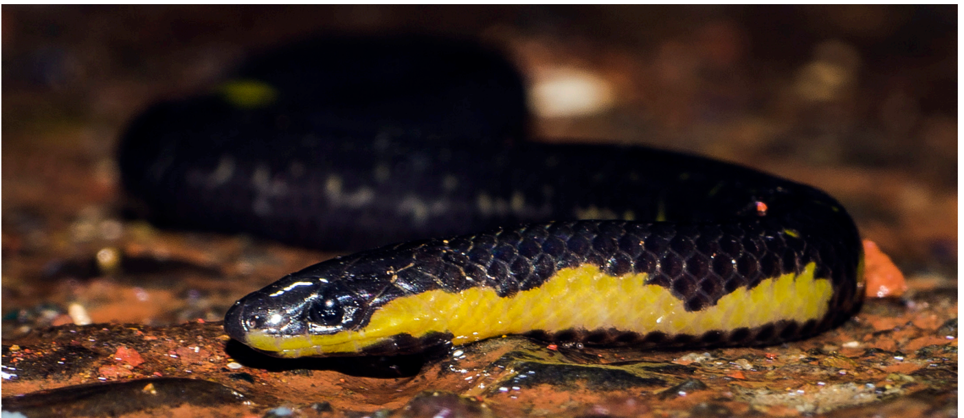
Fig. 4. A Bombay Shieldtail ( Uropeltis macrolepis ) from the Matheran Hill Station, Maharashtra, India.

(19.000081°N, 73.305339°E), the valley that comprises the area from Alexander Point to Garbut Point (18.982019°N, 73.280370°E) and Dasturi to Neral City (19.009166°N, 73.302664°E), the dense semi-evergreen forest in the stretch between Dasturi and Garbut Point (18.996161°N, 73.286378°E), Charlotte Lake, and numerous natural ponds. Trails along the railway tracks provided access to the area between the train stations Jummapatti and Aman Lodge (19.015475°N, 73.283309°E). Waterfalls in the area surrounding Vetaleshwar and Sunset Point (19.004455°N,