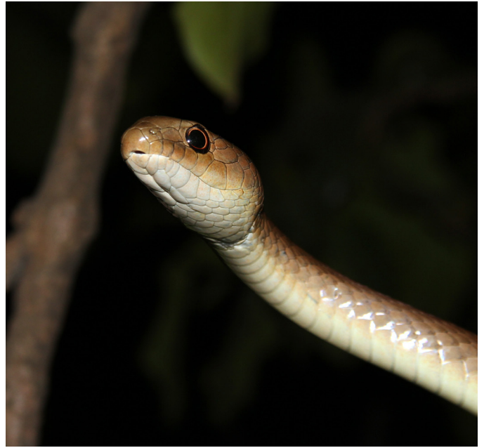
Fig. 3. A Stout Sandsnake ( Psammophis longifrons ) from the Matheran Hill Station, Maharashtra, India.

increase of human-mediated development, much of it to promote tourism. Consequently, detailed current information on the biodiversity of the area is necessary to raise awareness and promote conservation.