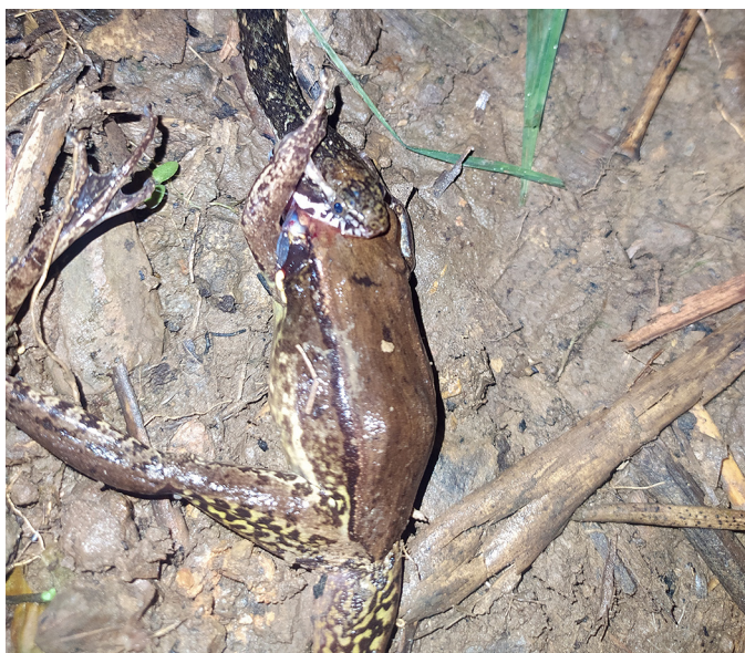
Fig. 1. A female Wall’s Keelback ( Herpetoreas xenura ) feeding on a female Assam Forest Frog ( Hydrophylax leptoglossa ).

At 2145 h on 27 July 2020, we encountered a female Herpetoreas xenura (SVL 467 mm) feeding on a female Assam Forest Frog ( Hydrophylax leptoglossa ) (total length 263 mm) on the edge of a pool surrounded by secondary forest used as a Betel Nut ( Areca catechu ) plantation at N. Hlimen, Mizoram, India (24.20198°N, 92.80833°E; elev. 577 m asl). The snake ambushed the frog, grasped its head (Fig. 1), and struggled with