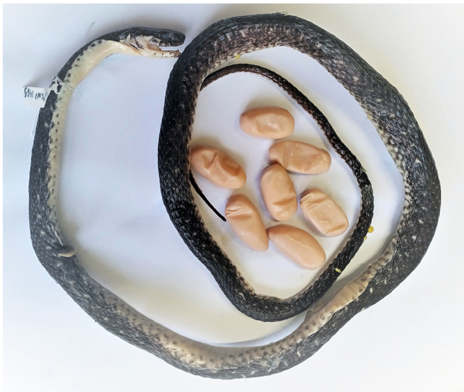
Fig. 3. A road-killed female Wall's Keelback ( Herpetoreas xenura ) with seven eggs recovered from the oviduct.

suffocated. Because we did not see the initial strike, we were unable to determine the elapsed time from strike to complete ingestion. The snake was not disturbed and escaped into nearby secondary forest.