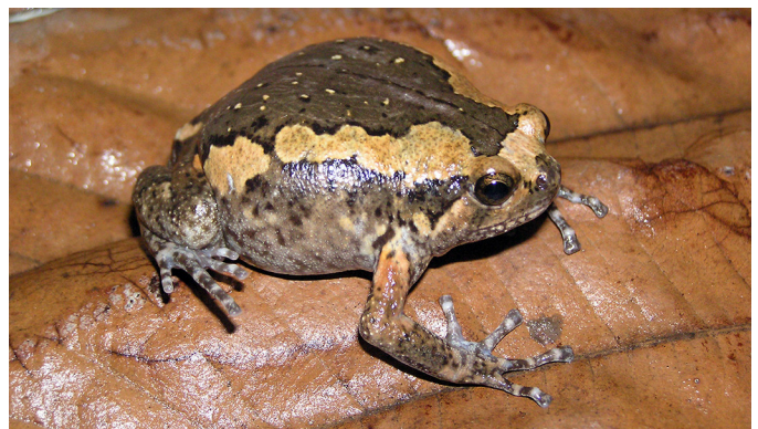
Fig. 1. An adult male Banded Bullfrog ( Kaloula pulchra ) from Kedah, Peninsular Malaysia.

describe defensive behaviors exhibited by Banded Bullfrogs when subjected to simulated threats.