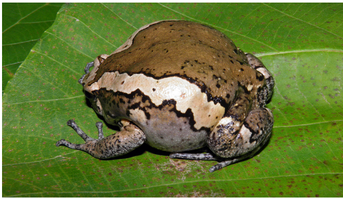
Fig. 3. Crouching by an adult male Banded Bullfrog ( Kaloula pulchra ).

I collected four adult male Banded Bullfrogs by hand while searching between 2100 and 2200 h along cement drains, ditches, roadside pools, rain puddles, and open areas near human habitations at Kulim Hi-Tech Park, Kulim, Kedah, Peninsular Malaysia (5°24'N, 100°34'E; elev. 56 m asl). I took the frogs to the laboratory, where I subjected them to simulated threats and photographed their responses before releasing them in suitable habitat.