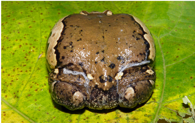
Fig. 5. An adult male Banded Bullfrog ( Kaloula pulchra ) exhibiting inflation and deimatic behavior while exuding presumably noxious skin secretions.

of predators without employing alternative defensive strategies. All four of the males examined inflated their bodies when disturbed, suggesting that this behavior is used frequently by these frogs. The increase in size alone might discourage potential predators (Williams et al. 2000), but this strategy, which can be employed on the ground or on vegetation, while floating in water, or while being seized by a predator, is often accompanied by other behaviors (Toledo et al. 2011). In this study, frogs combined inflation with crouching, deimatic behavior, and exuding skin secretions, in one case, even while engaged in crawling toward cover. Crouching, exhibited by frog 2, typically is performed synergistically with chin-tucking, inflation, and exuding skin secretions (Toledo et al. 2011). Anuran skin secretions, which I saw only in frog 4, fall into four categories, odoriferous (Smith et al. 2004), adhesive, noxious, or slippery (Toledo et al. 2011), and often accompany other defensive behaviors. That of K. pulchra is known to be adhesive (Evans and Brodie 1994) and might have other properties as well.