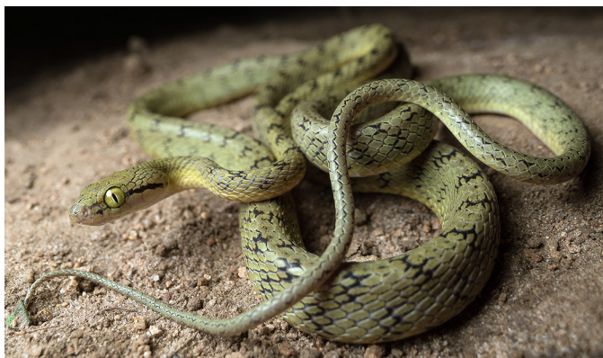
Fig. 1. An adult female Yellow-green Catsnake ( Boiga flaviviridis ) from Killa Ghanpur, Jangoan District, Telangana, India.