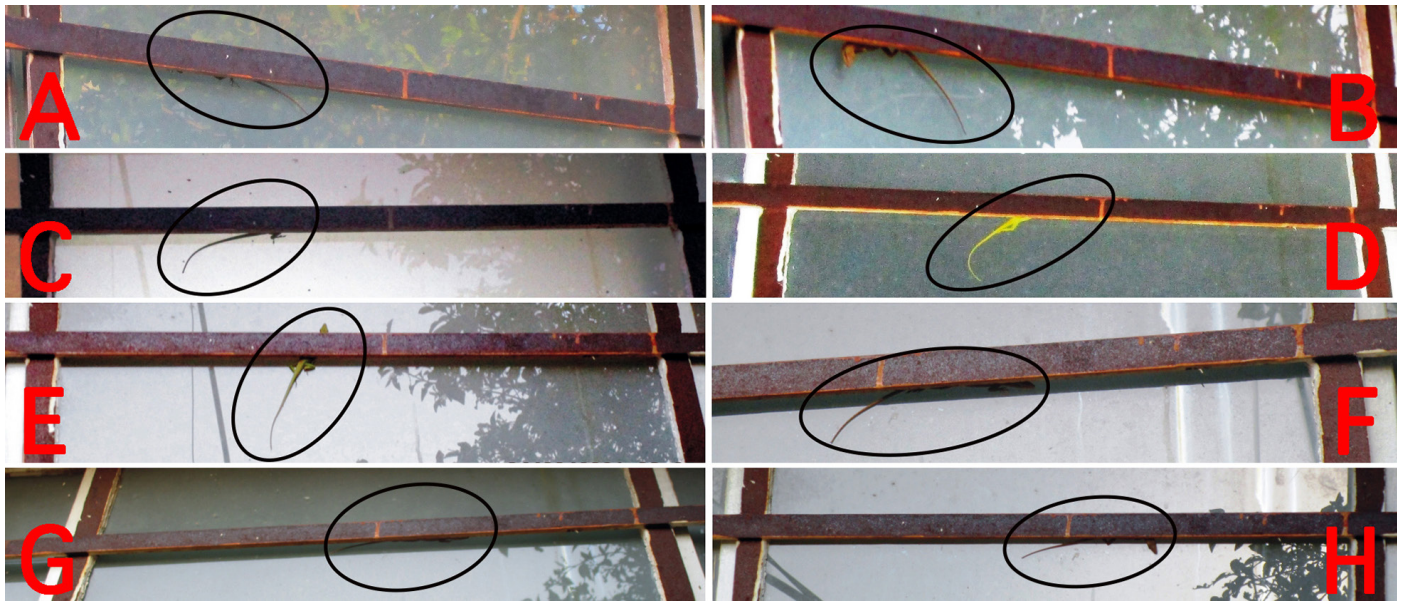
Fig. 2. Successive postures assumed by a female Cuban Green Anole ( Anolis porcatius ) through the night of 8–9 April 2021: At 1754 h (A); at 1832 h (B); at 1859 (C); at 0047 h (D); at 0635 h (E); at 0708 h (F); at 0726 h (G); and at 0726 h (H).

On one occasion, a House Sparrow ( Passer domesticus ), an occasional predator of some lizards (Bello 2000; Guerra-Solana and Armas 2017), flew near the window at 0618 h, triggering a quick postural change by the anole before she abandoned the sleep-site four minutes later.