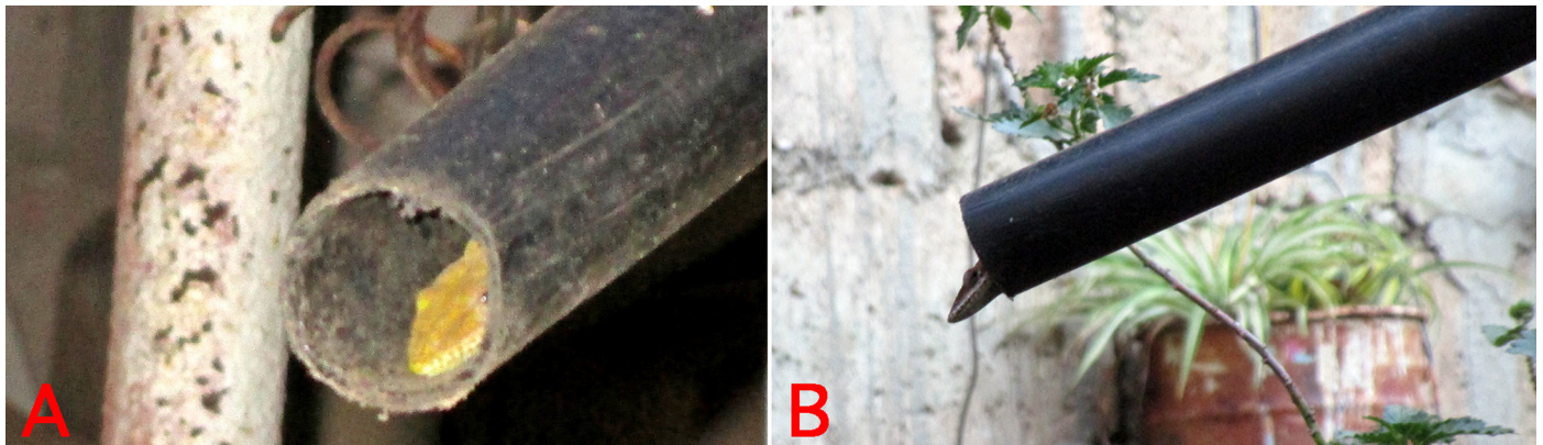
Fig. 4. Sleeping site chosen by a male Cuban Green Anole ( Anolis porcatus ) in the backyard of an urban residence in San Antonio de los Baños, Artemisa Province, Cuba, in a polyethylene tube (inside diameter 2.7 cm; height 1.6 m above the ground): At 0543 h just prior to emergence (A) and at 1850 h just after entry (B).

slept inside a polyethylene tube (diameter 27 mm, inclination approx. 40°) 1.60 m above the ground (Fig. 4); the other male slept vertically with head up on one of two adjacent leaves (separated by 3 cm) of a Fragrant Aerides ( Aerides odorata , Orchidaceae) 0.85 m above the ground (Fig. 5). Both males returned to their respective sleep-sites between 1840 and 1910 h each night and left them between 0550 and 0605 h the next morning. Both sleep-sites were near the peripheries of the males' diurnal home-ranges. The male that slept on the orchid leaf did not change its position during the night. The other male would enter the tube, turn, and, after 3–5 min, return to the mouth of the tube, showing its head and sometimes its neck (Fig. 4B) for 13–25 min before turning again to disappear in the tube. In the morning, it would show