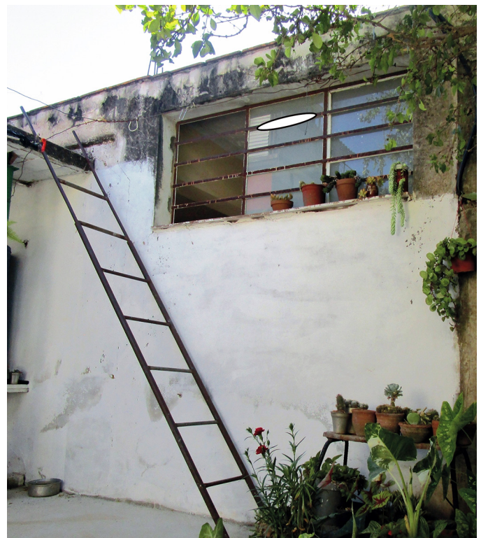
Fig. 1. General aspect of the study area (a window in the backyard of an urban residence in San Antonio de los Baños, Artemisa Province, Cuba). The small white oval on the window indicates the sleeping site chosen by a female Cuban Green Anole ( Anolis porcatatus ).

conferred the maximum protection), less frequently inclined, and rarely vertical. When in a vertical or inclined position, her head was oriented either downward or upward, including both during some nights. She most frequently slept under the central area of the iron plate, less frequently 15 cm left of center, and, most rarely, 16 cm right of center (Fig. 3), but never farther than 16 cm from the most frequently chosen site during the 48 consecutive nights.