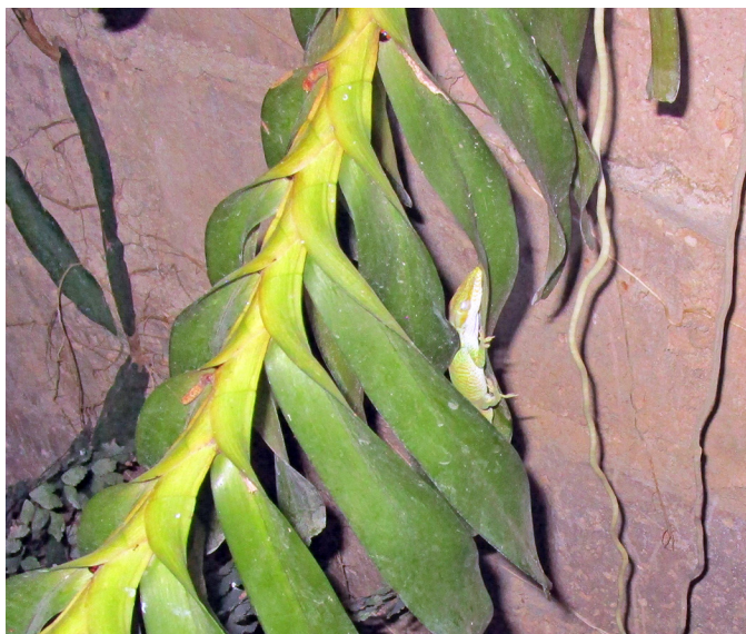
Fig. 5. Sleeping site chosen by a male Cuban Green Anole ( Anolis porcatus ) in the backyard of an urban residence in San Antonio de los Baños, Artemisa Province, Cuba, along a leaf of an orchid ( Aerides odorata ) 0.85 m above the ground at 2120 h.

slept inside a polyethylene tube (diameter 27 mm, inclination approx. 40°) 1.60 m above the ground (Fig. 4); the other male slept vertically with head up on one of two adjacent leaves (separated by 3 cm) of a Fragrant Aerides ( Aerides odorata , Orchidaceae) 0.85 m above the ground (Fig. 5). Both males returned to their respective sleep-sites between 1840 and 1910 h each night and left them between 0550 and 0605 h the next morning. Both sleep-sites were near the peripheries of the males' diurnal home-ranges. The male that slept on the orchid leaf did not change its position during the night. The other male would enter the tube, turn, and, after 3–5 min, return to the mouth of the tube, showing its head and sometimes its neck (Fig. 4B) for 13–25 min before turning again to disappear in the tube. In the morning, it would show