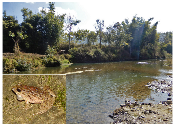
Fig. 1. A male Bangladeshi Cricket Frog ( Minervarya asmati ) (MZMU 2239) collected from along the Chakpi River, Manipur, India.

ments of mitochondrial 16S rRNA using the primers forward (L02510-CGC CTG TTT ATC AAA AAC AT) (Palumbi 1996) and reverse (H03063-CTC CGG TTT GAA CTC AGA TC) (Rassmann 1997), and sequenced the sample using the Sanger dideoxy method, carrying out the reactions in both directions on a sequencer (Barcode Bioscience, Bangalore, India). The generated partial 16S rRNA sequences were deposited in GenBank (GenBank MW687119). We compared our sample to 15 previously published sequences of 16S rRNA (Kuramoto et al. 2007; Kotaki et al. 2008, 2010; Dinesh et al. 2015; Howlader et al. 2016; Suwannapoom et al. 2017) retrieved from the NCBI database, using one