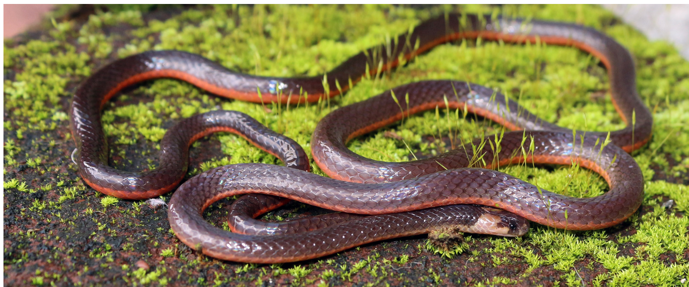
Fig. 1. A Castoe’s Coralsnake ( Calliophis castoe ) from Madilge, Ajra, Kolhapur, Maharashtra, India.

At 1700 h on 23 January 2021, we received a call for a snake rescue from Madilge (16.16878°N, 74.22730°E; 685 m asl). We identified the snake as C. castoe and released it in natural habitat after taking photographs. Photographs were sent to Varad Giri, who confirmed the identity of the snake. We deposited a photographic voucher (Fig. 1) in the Zoological Reference Collection in the Lee Kong Chian Natural History Museum at the National University of Singapore (ZRC(IMG) 2.564). At 1100 h on 28 August 2020, we collected a dead specimen of the same species near the residential area of Honewadi (16.11712°N, 74.24222°E; 706 m asl). We extracted tissue for molecular analysis from the tip of the tail before fixing the specimen in 4% formalin and preserving it in 70% alcohol. These records extend the range of C. castoe by about 35 km